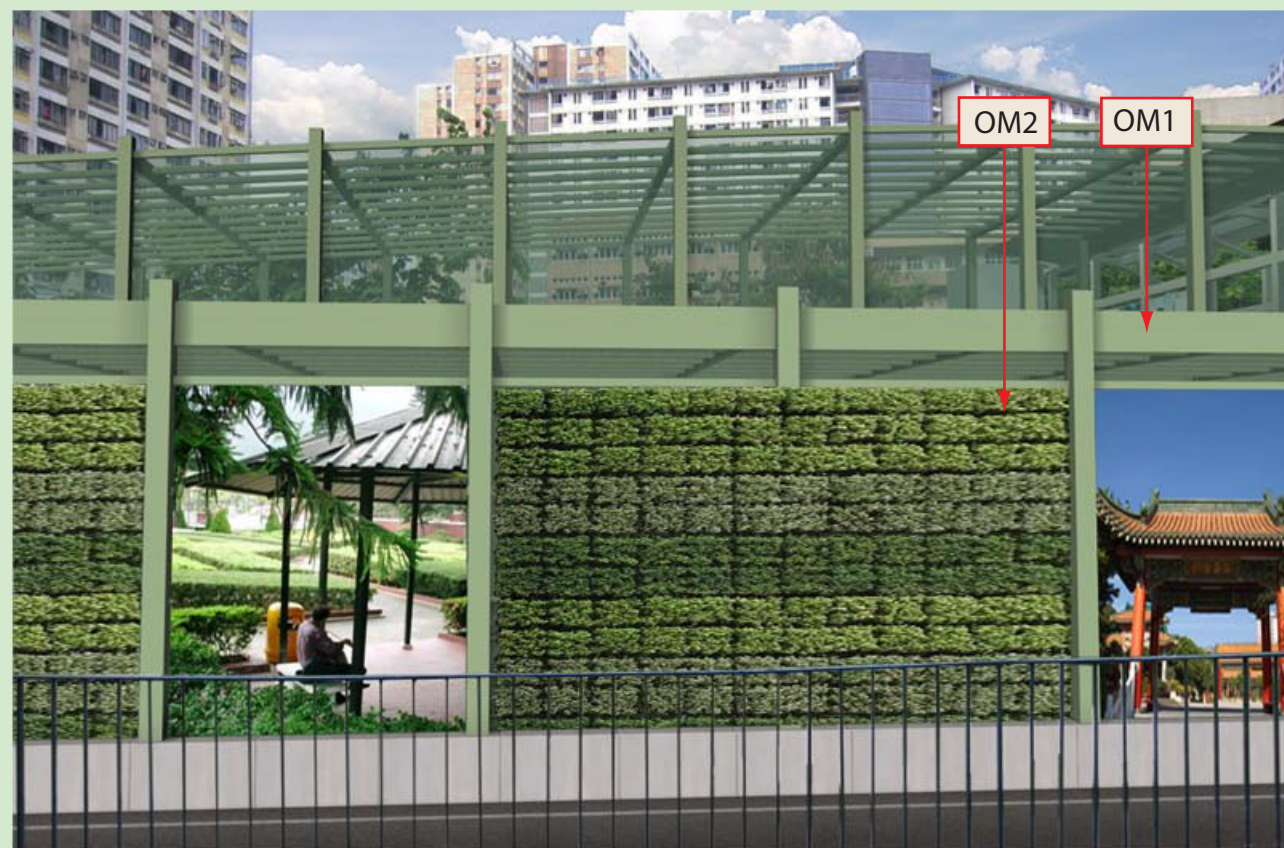
Day 1 with Mitigation Measure