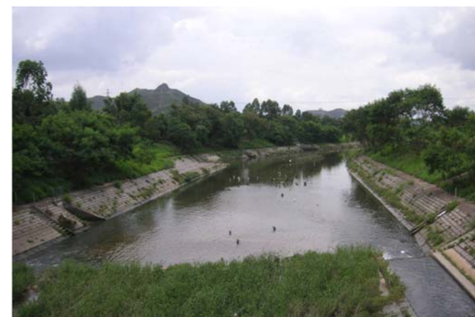
KLR1.3 - Sheung Yue River (channelized)