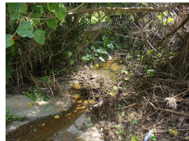
KLR2.2 - Natural Streams at Tai Shek Mo