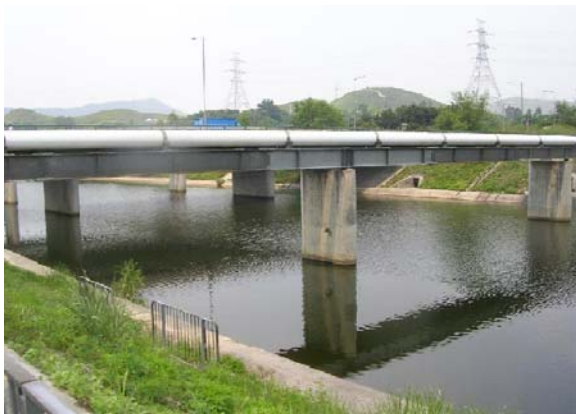
KLR1.1 - Ng Tung River (channelized)