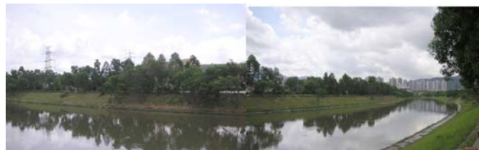
KLR1.2 - Shek Sheung River (channelized)