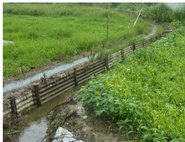
KLR1.4 – Watercourse Network in Long Valley