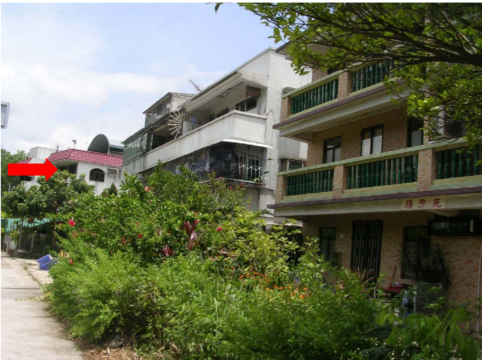
KLR 12.7- -Rural Development Area at Wo Hop Shek and Wong Kong Shan