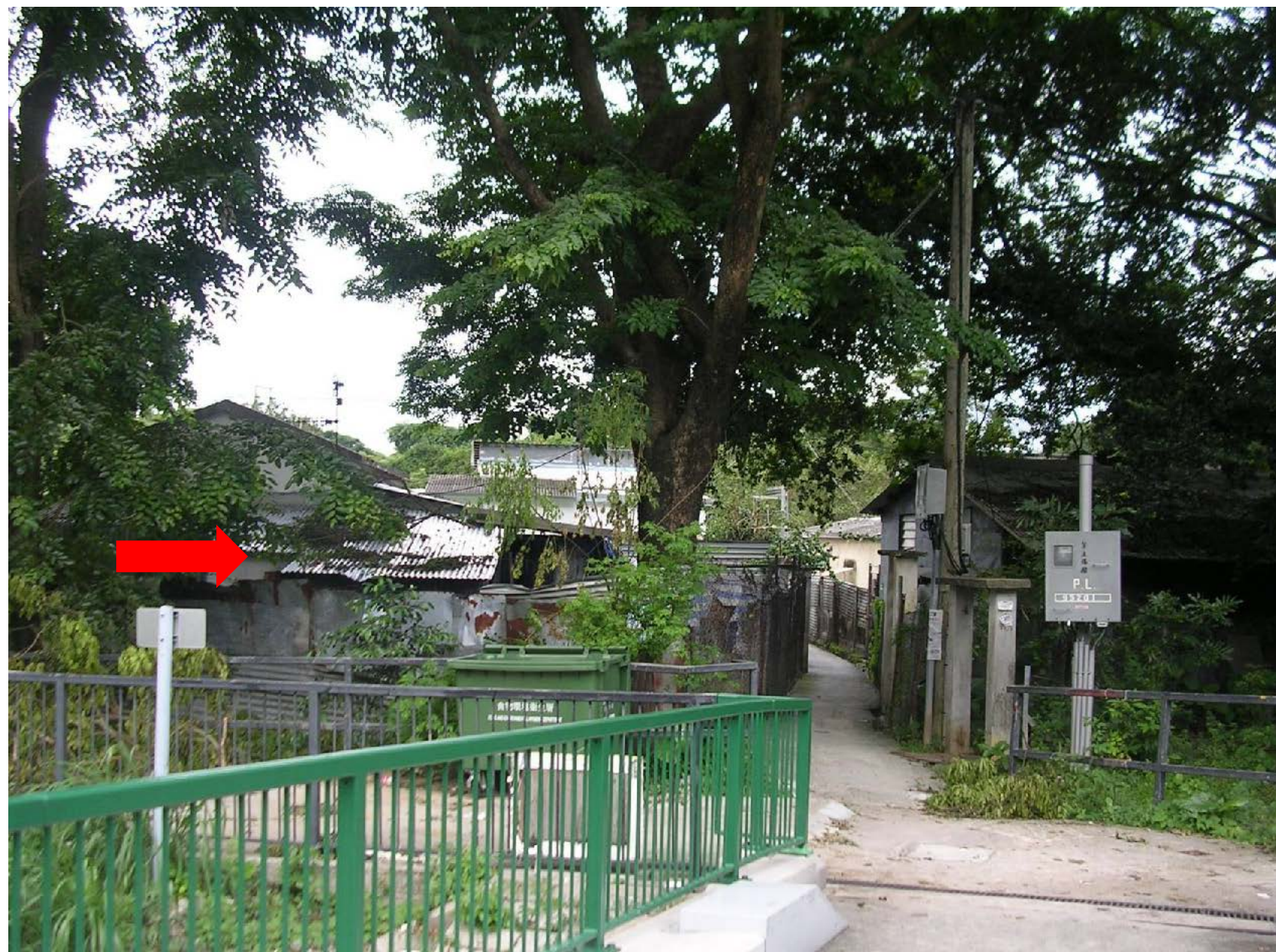
KLR 12.6--Lung Yeuk Tau Rural Development Area