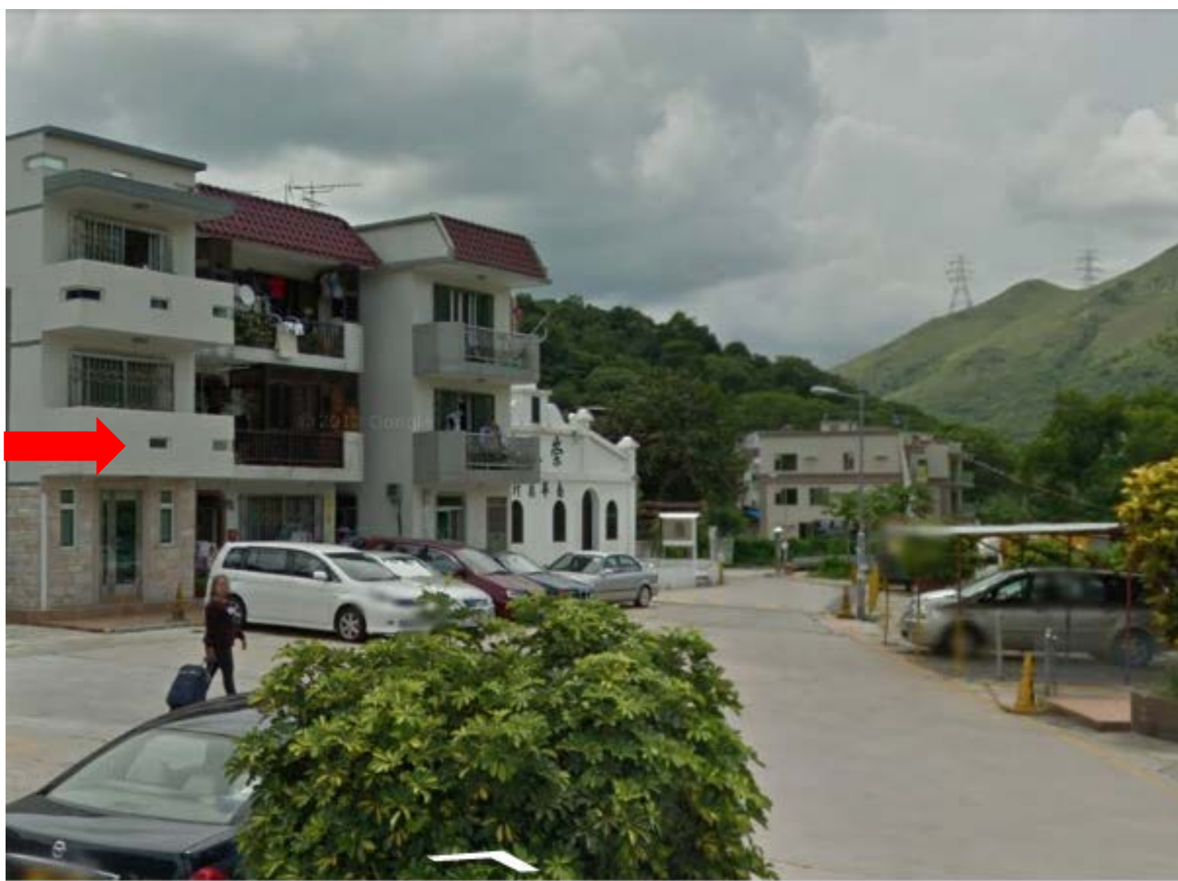
FLR 12.11 -- Rural Development Area at Kiu Tau and Nam Wa Po