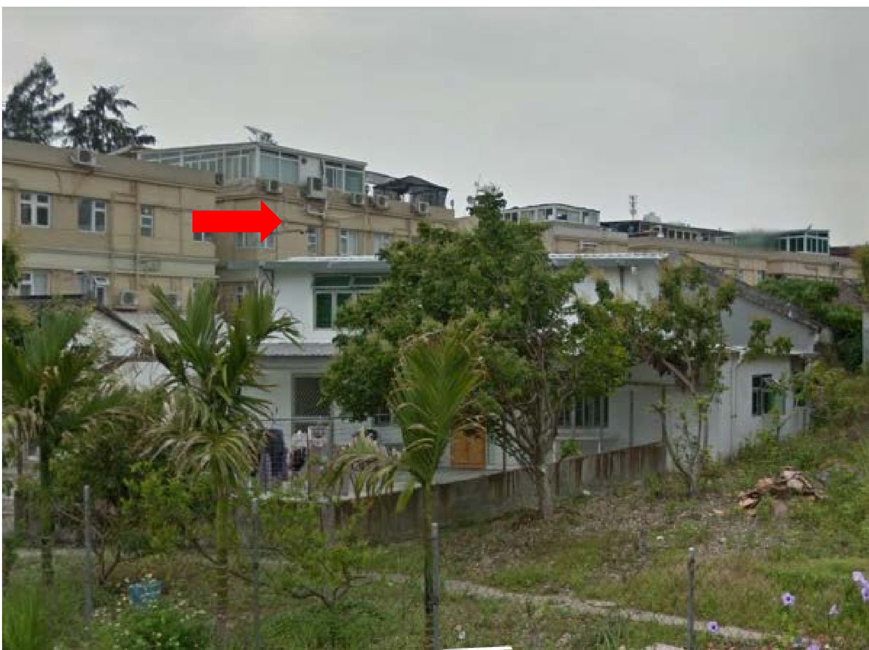
KLR 12.10 -- Rural Development Area at Lung Shan and Kau Lung Hang Shan