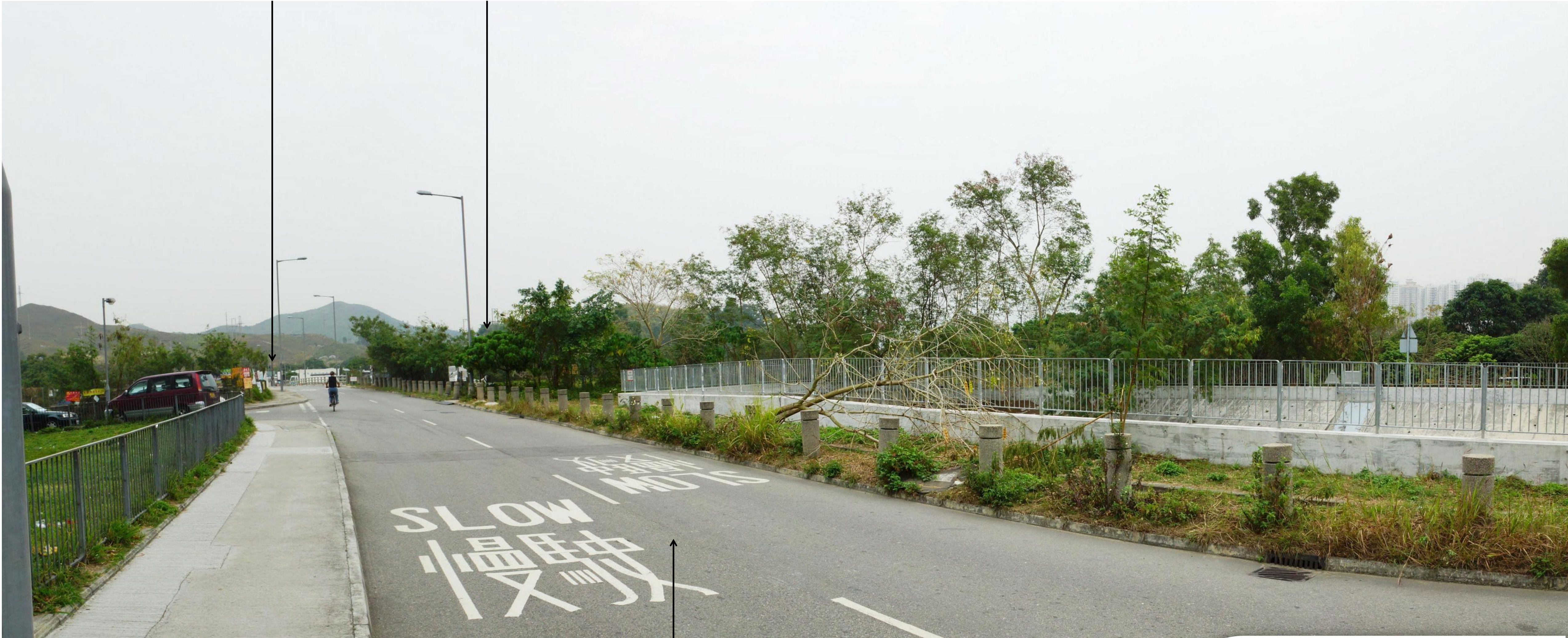
Road leading to Junction of Lung Sum Avenue and Tin Ping Road.

Relevant schedule 2 Designated Projects: DP 13 – Construction of New Sewage Pumping Stations in FLN NDA