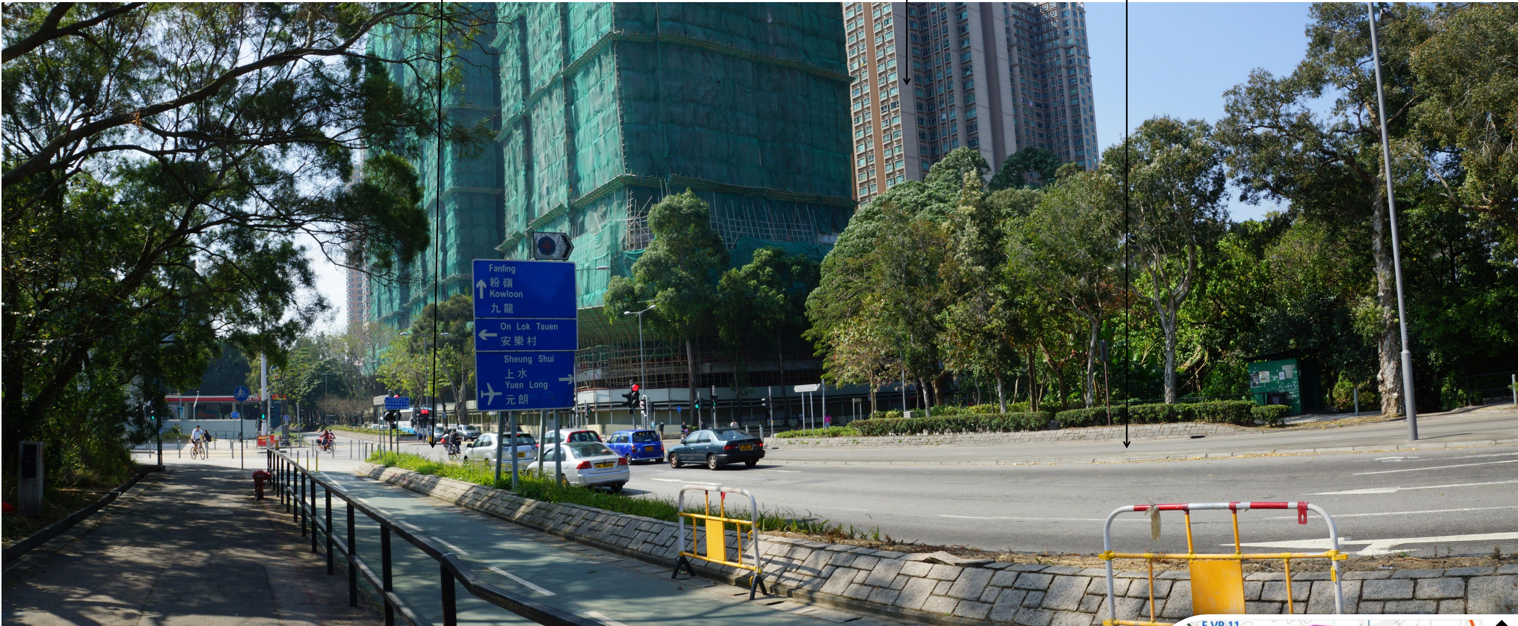
Sha Tau Kok Road—Lung Yuek Tau

Relevant schedule 2 Designated Projects: DP 10 – Fanling Bypass Eastern Section