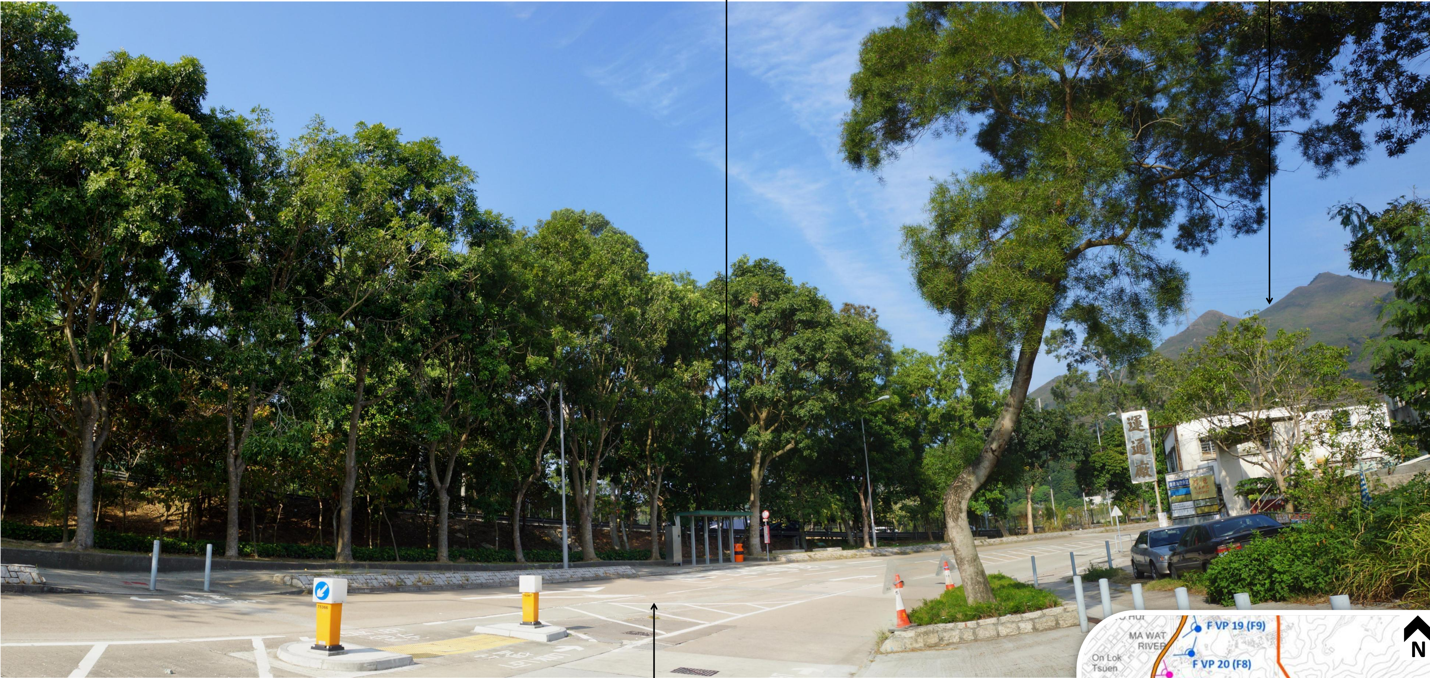
Wo Hing Road

Relevant schedule 2 Designated Projects: DP 10 – Fanling Bypass Eastern Section