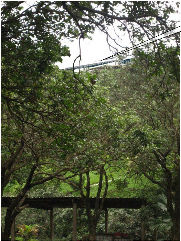
Day 1 of Operation Phase without Landscape and Visual Mitigation Measures