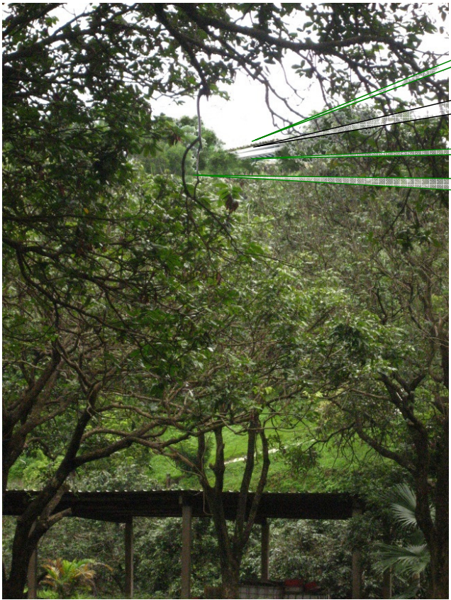
Year 10 of Operation Phase with Landscape and Visual Mitigation Measures