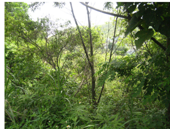
LR3.1 – Shrubland by Existing Livestock Waste Recycling Plant