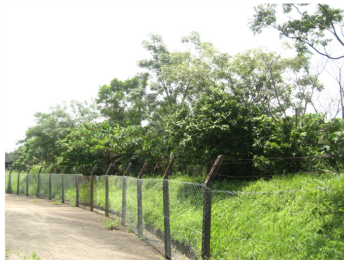
LR1.1 – Plantation by Existing Livestock Waste Recycling Plant