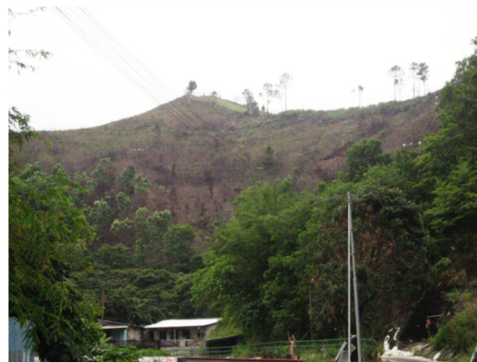
LR4.2 – Hillside Grassland by Cheung Po Tau