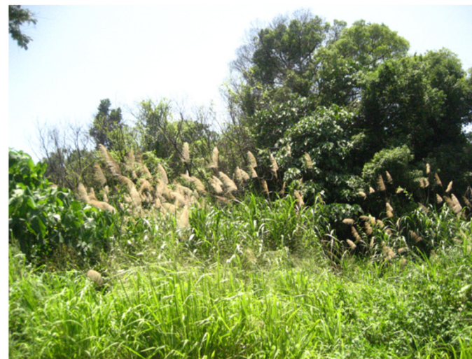
LR1.2 – Plantation by Kong Nga Po Road