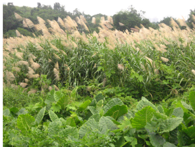
LR4.1 – Open Grassland by Sha Ling