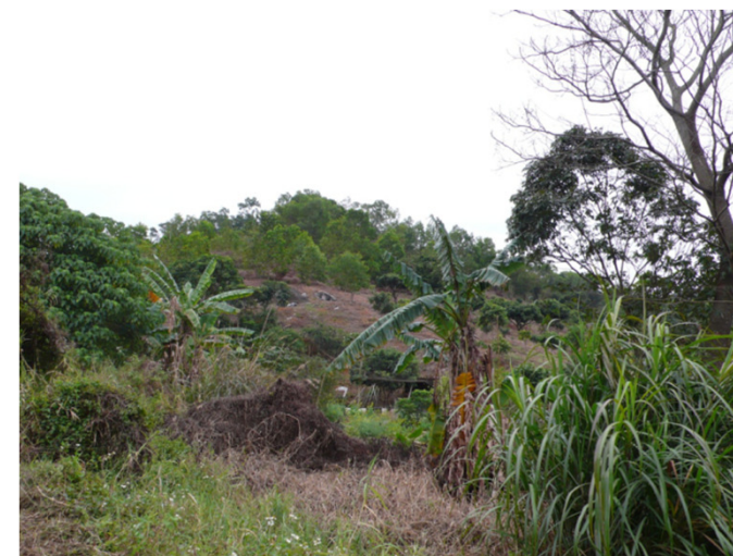
LR4.3 – Grassland by Sandy Ridge