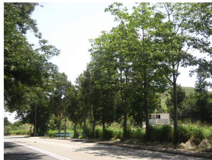
LR2.2 – Roadside Amenity Planting along Man Kam To Road