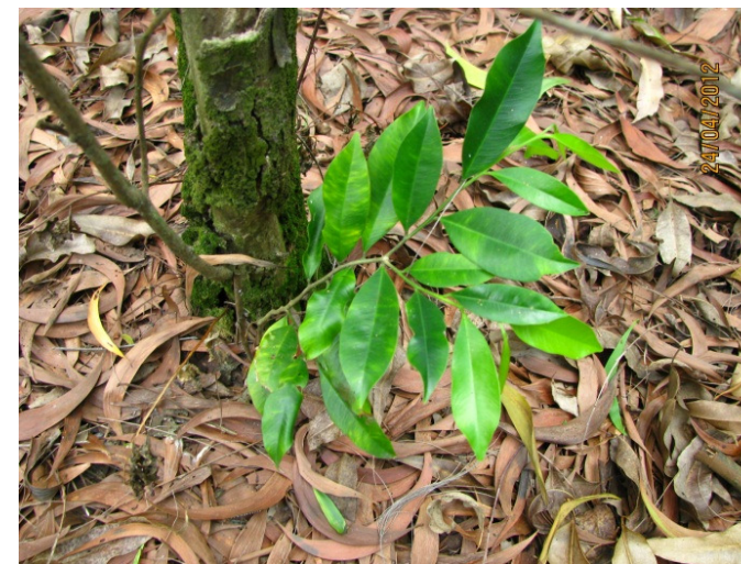
LR1.3 – Aquilaria sinensis