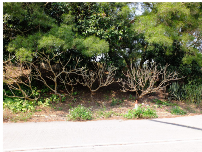
LR2.1 – Landscape Planting within Existing Livestock Waste Recycling Plant