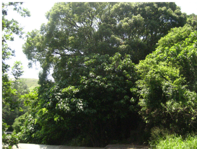
LR6.3 – Small Wooded Hill