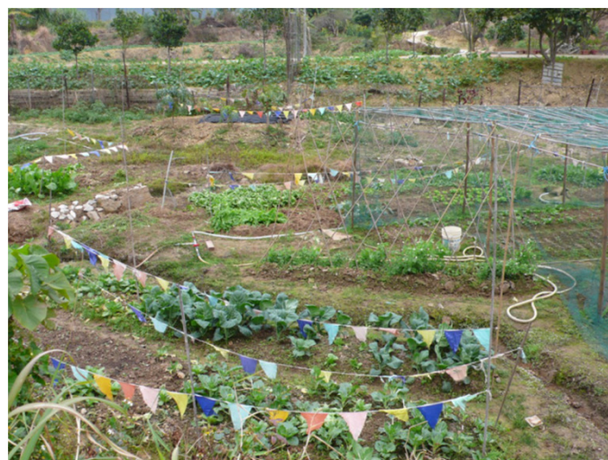
LR9.1 – Farmland by San Uk Ling Holding Centre