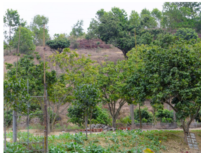
LR8.1 – Orchard by Kong Nga Po