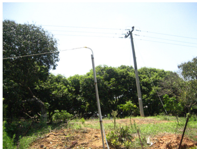
LR8.3 – Orchard by Sha Ling Road