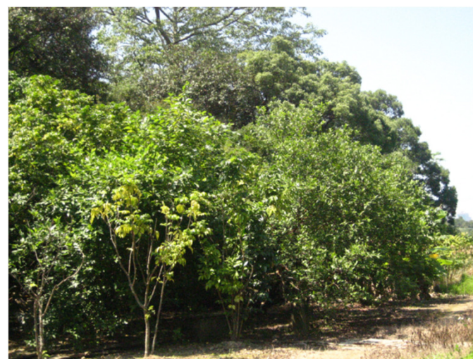
LR8.4 – Orchard by Man Kam To Road