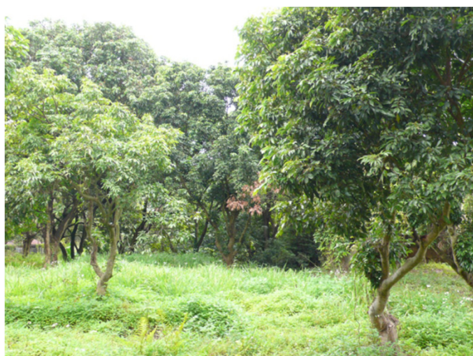
LR8.2 – Orchard by San Uk Ling Holding Centre