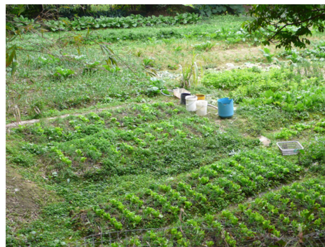
LR9.2 – Farmland by Sha Ling