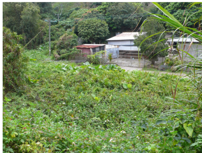
LR7.1 – Open Field