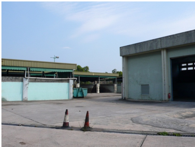
LR10.1 – Developed Land