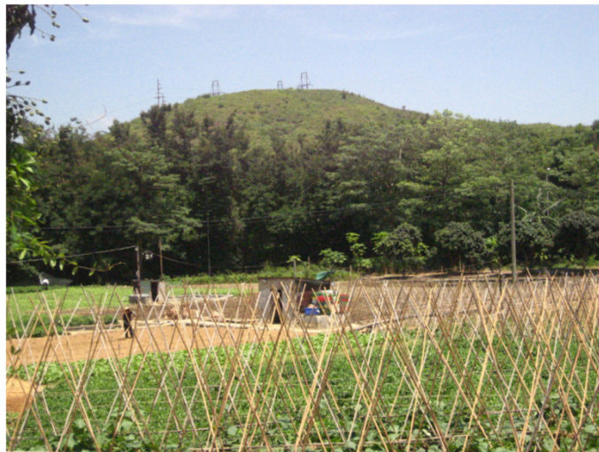
LR9.3 – Farmland by Man Kam To Road