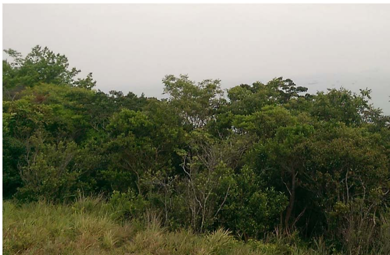
LR6 Mixed Shrubland (2)