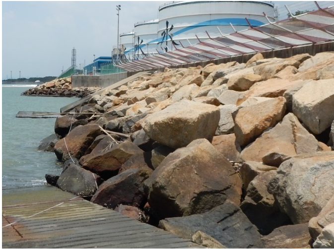
LR1 Artificial Shoreline