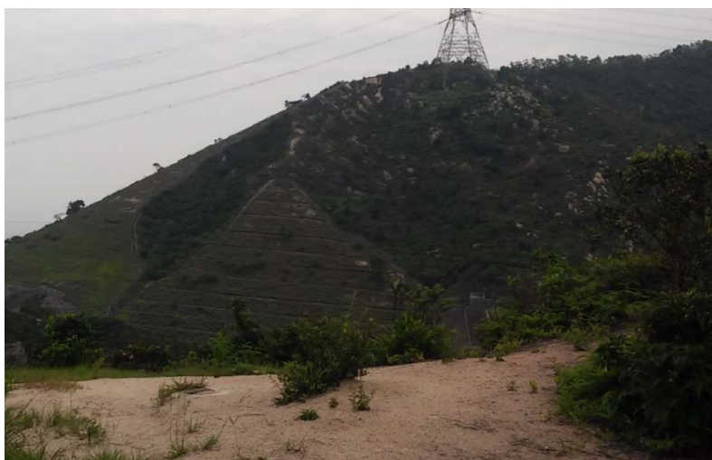
LR7 Vegetated Modified Slopes