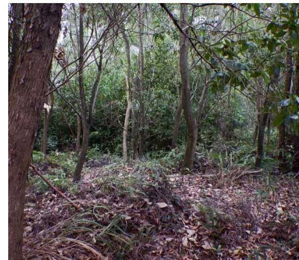
LR6 Mixed Shrubland (3)