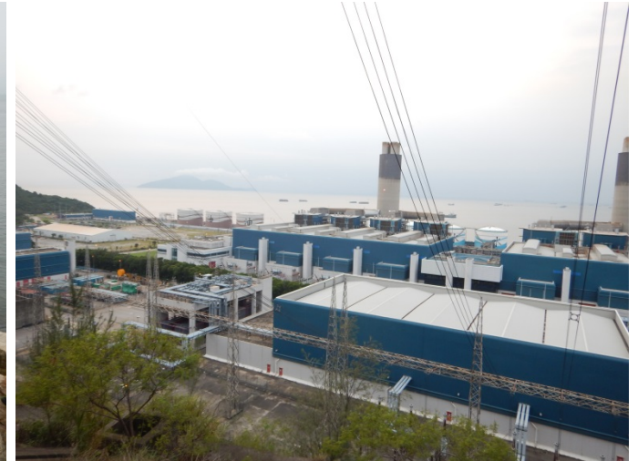
LR3 Highly Modified Area