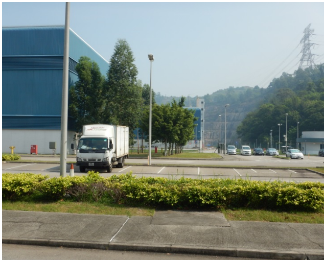
LR3 Highly Modified Area ( Showing some soft-landscaped areas unaffected by Project – More details of soft-landscaping in this LR are in Annex 12A )