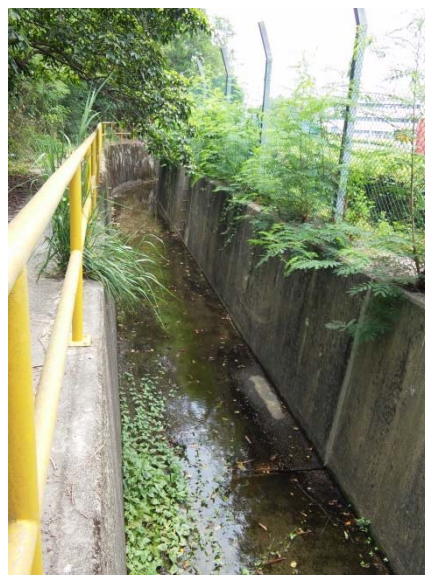
LR8 Water Channel