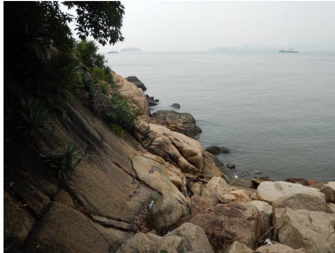
LR2 Natural Rocky Shore