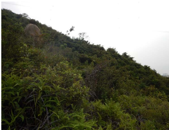
LR6 Mixed Shrubland (1)