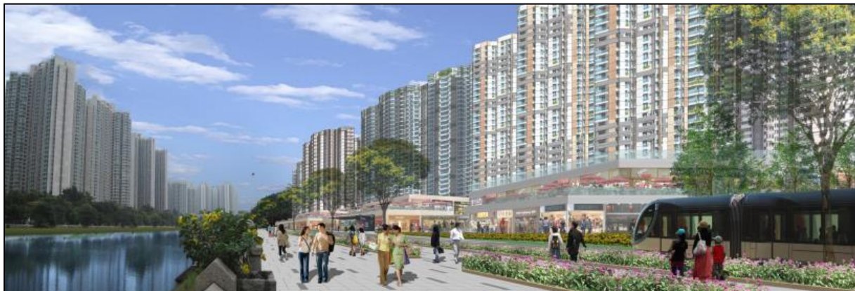
Conceptual diagram of revitalised river channel