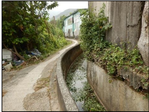
Modified watercourse receiving effluent from adjacent properties