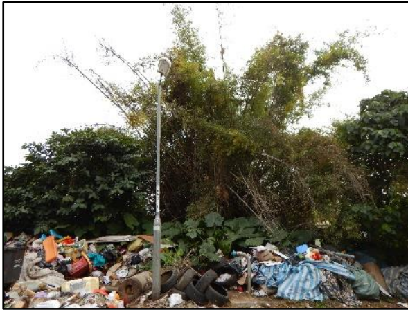
Egretty disturbed by brownfield activities