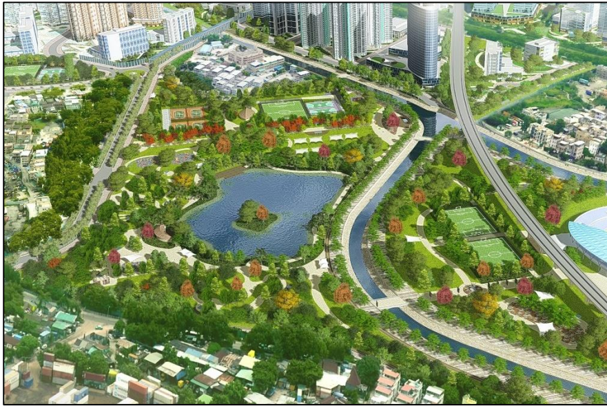
Conceptual diagram of flood retention lake proposed in Regional Town Park and revitalised river channels