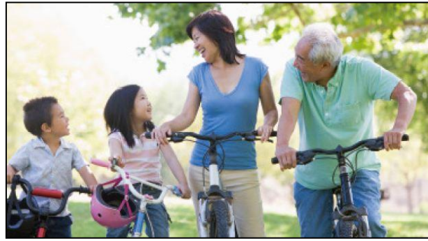
Environmentally-friendly modes of transport