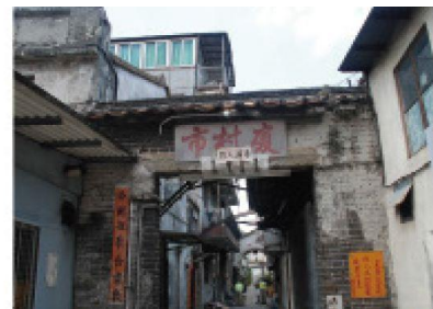
Examples of built heritage within the Project area