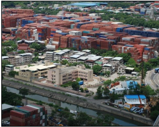
Open storage near villages

been introduced to the area. This area includes a range of residential developments with various densities. These are generally low to medium-rise modern developments formed on lots of various scales. Individual developments have been realised incrementally over time as developers have assembled land of sufficient scale to enable development.