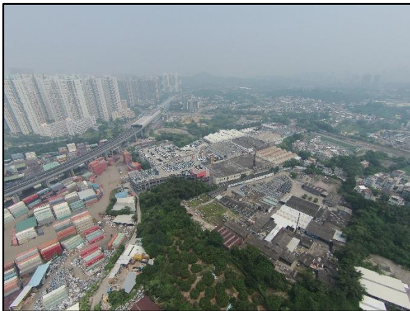
Rural Industry and Open storage near village areas