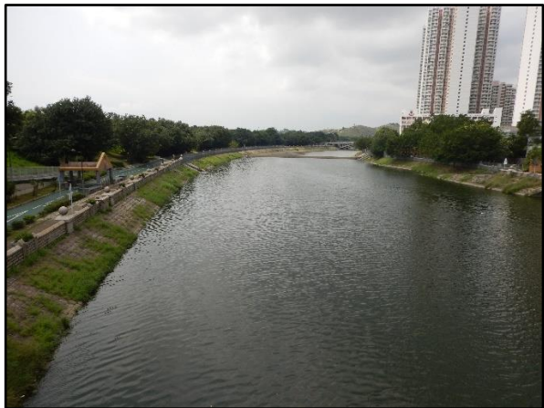
Concrete-lined banks of the TSW Main Channel