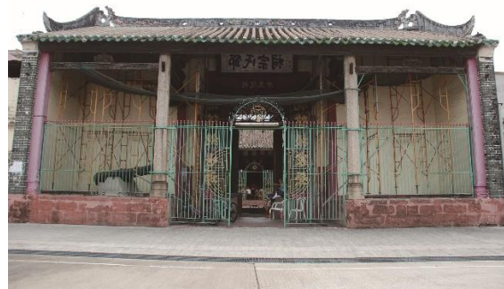
Built heritage within villages