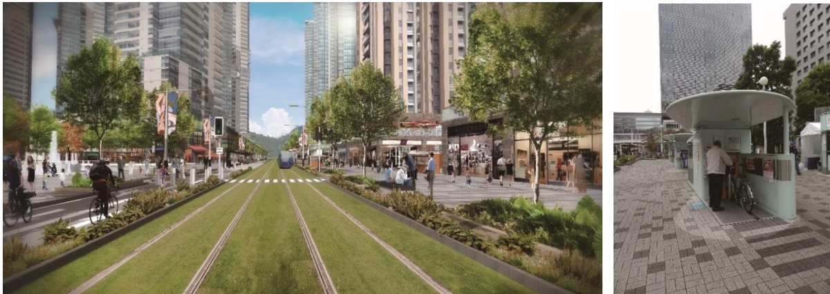
Conceptual diagram of GTC and environmentally-friendly modes of transport