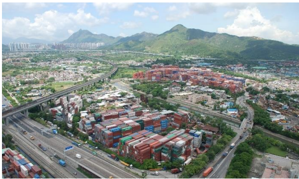
Large areas occupied by brownfield operations