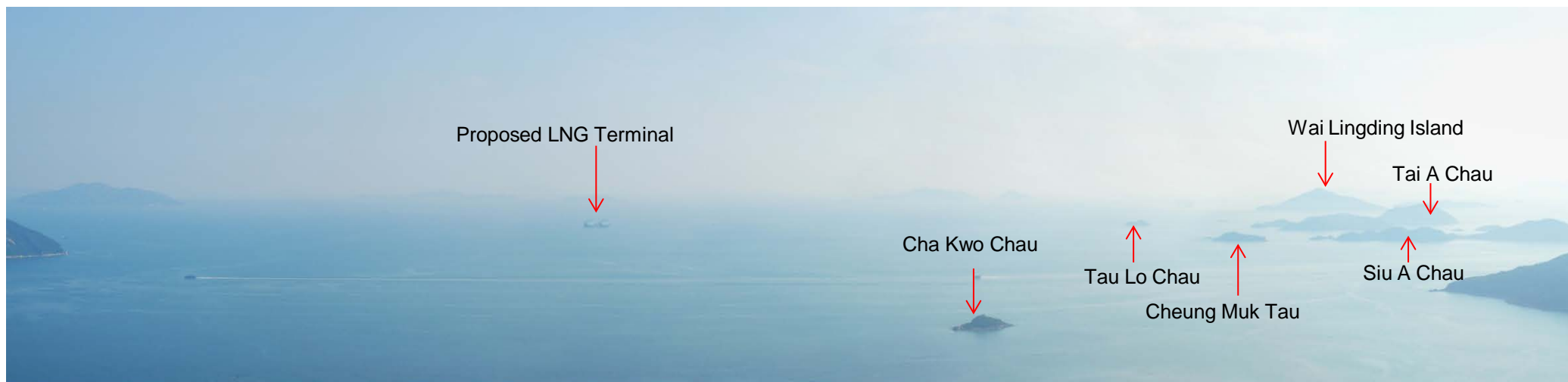
VP12 – Photomontage at Day 1 of operation with mitigation / enhancement