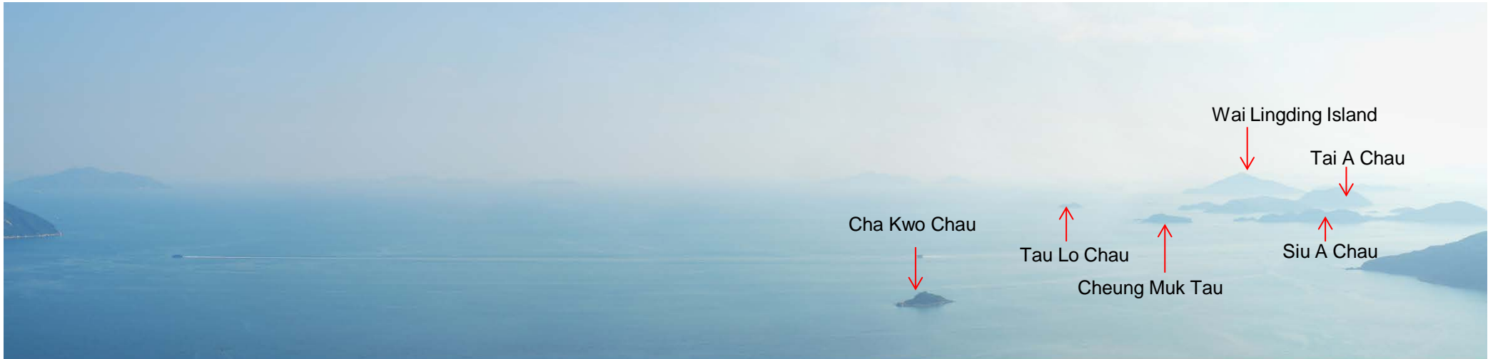
VP12 – Existing conditions