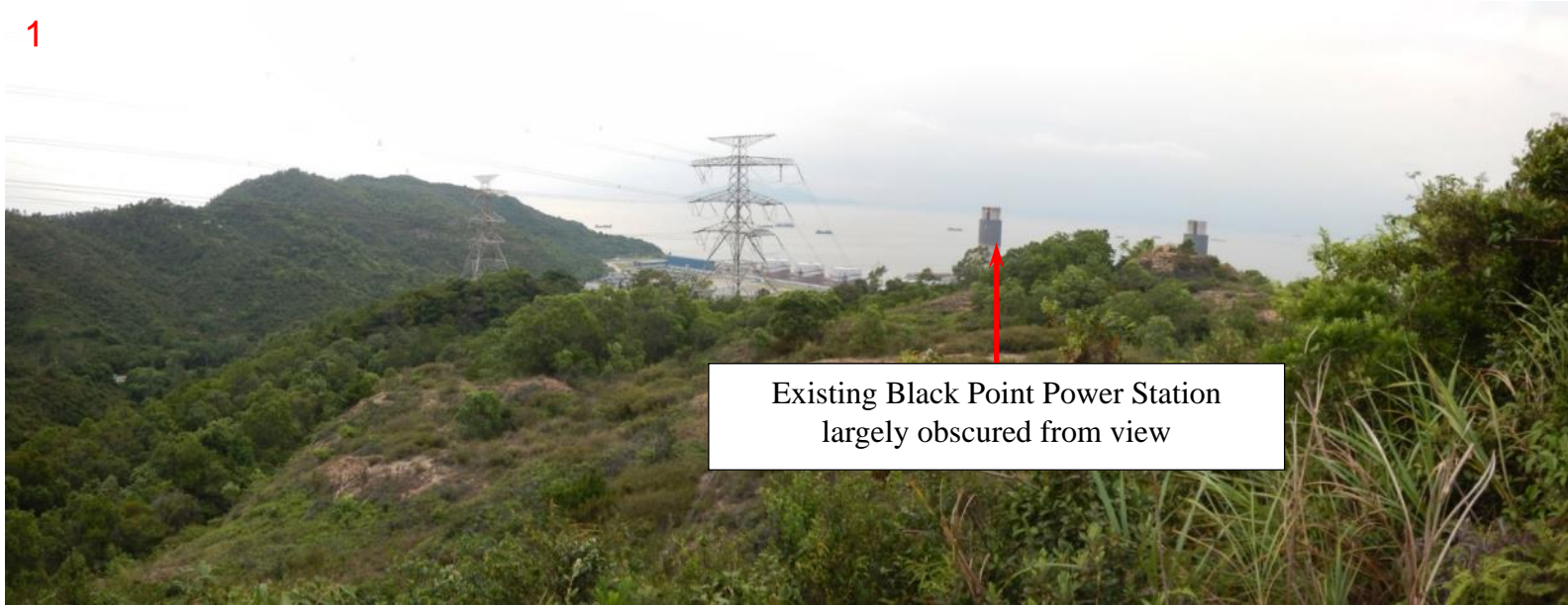
Existing Black Point Power Station largely obscured from view

VSR 16 Visitors to Black Point Hill and nearby area – vegetation and topography from just off Nim Wan Road largely blocks views of BPPS. Only the very tall chimneys and part of the fuel tanks are visible