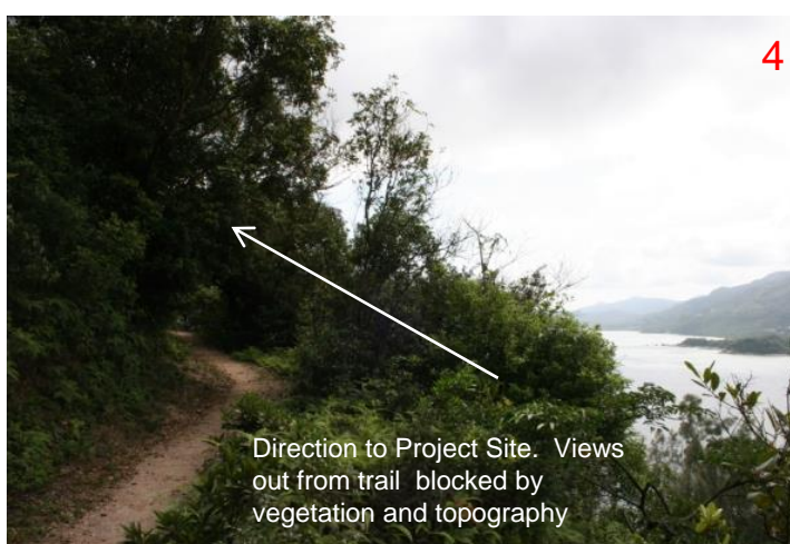
VSR 12 Hikers in eastern Lantau South Country Park – vegetation and topography often block views along sections of the trails