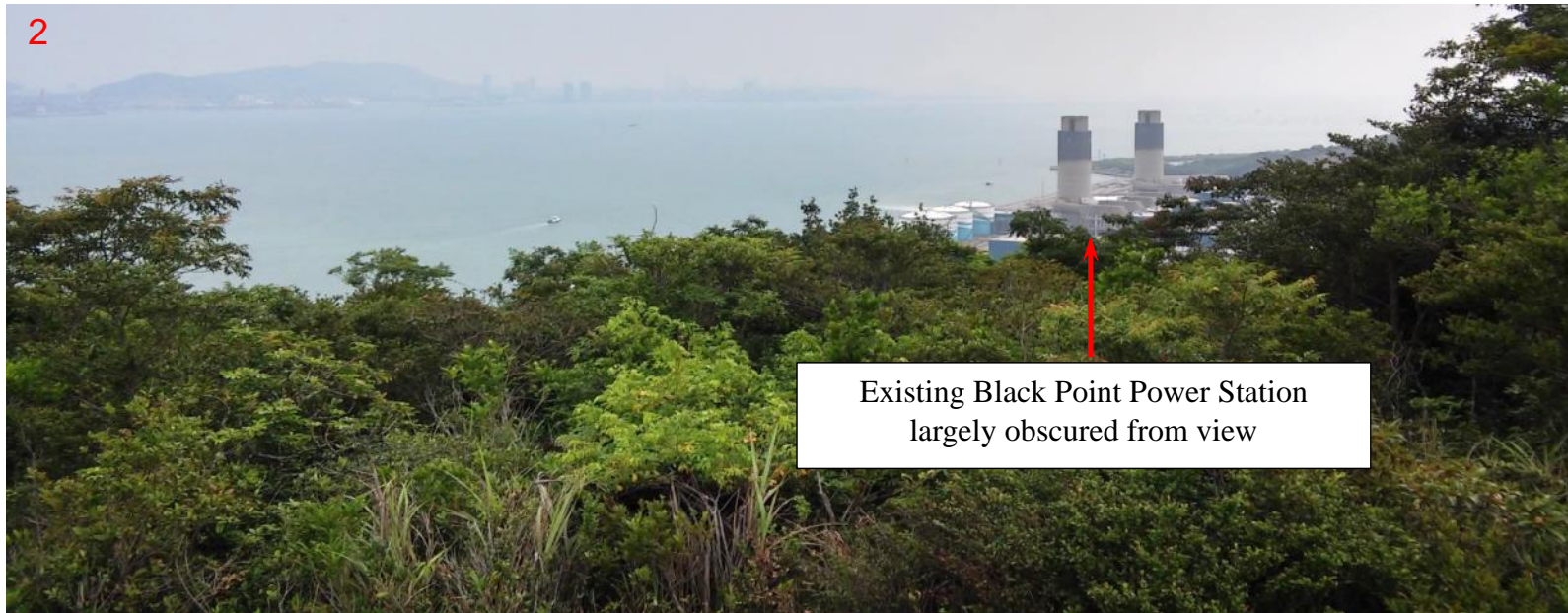
Existing Black Point Power Station largely obscured from view