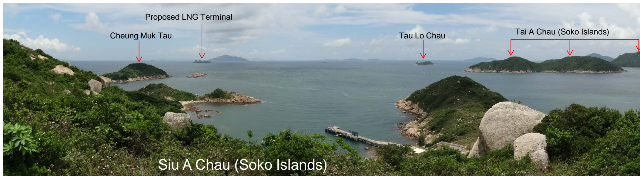
VP1 – Photomontage at Day 1 of operation with mitigation / enhancement