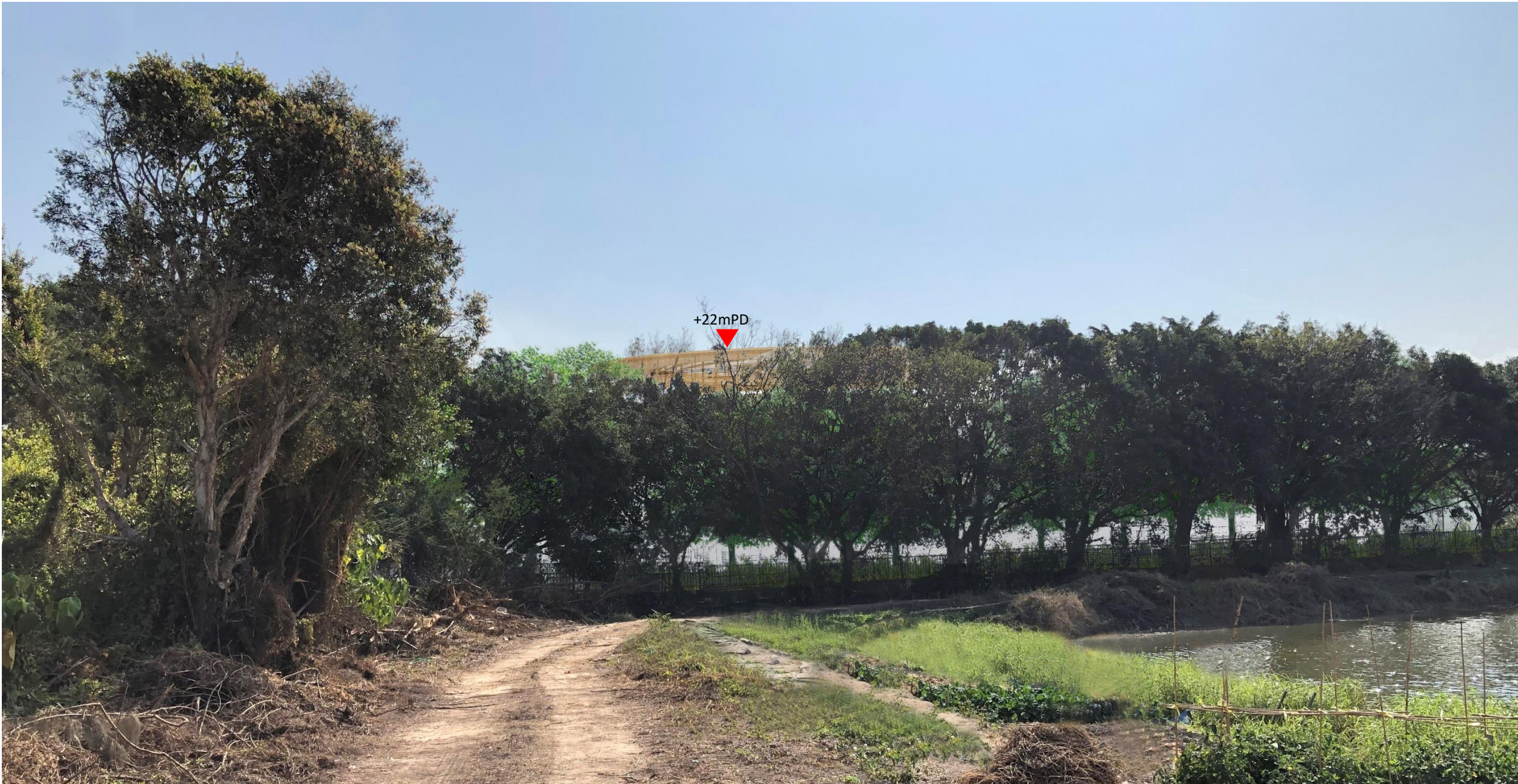
Year 10 of Operation with Landscape and Visual Mitigation Measure