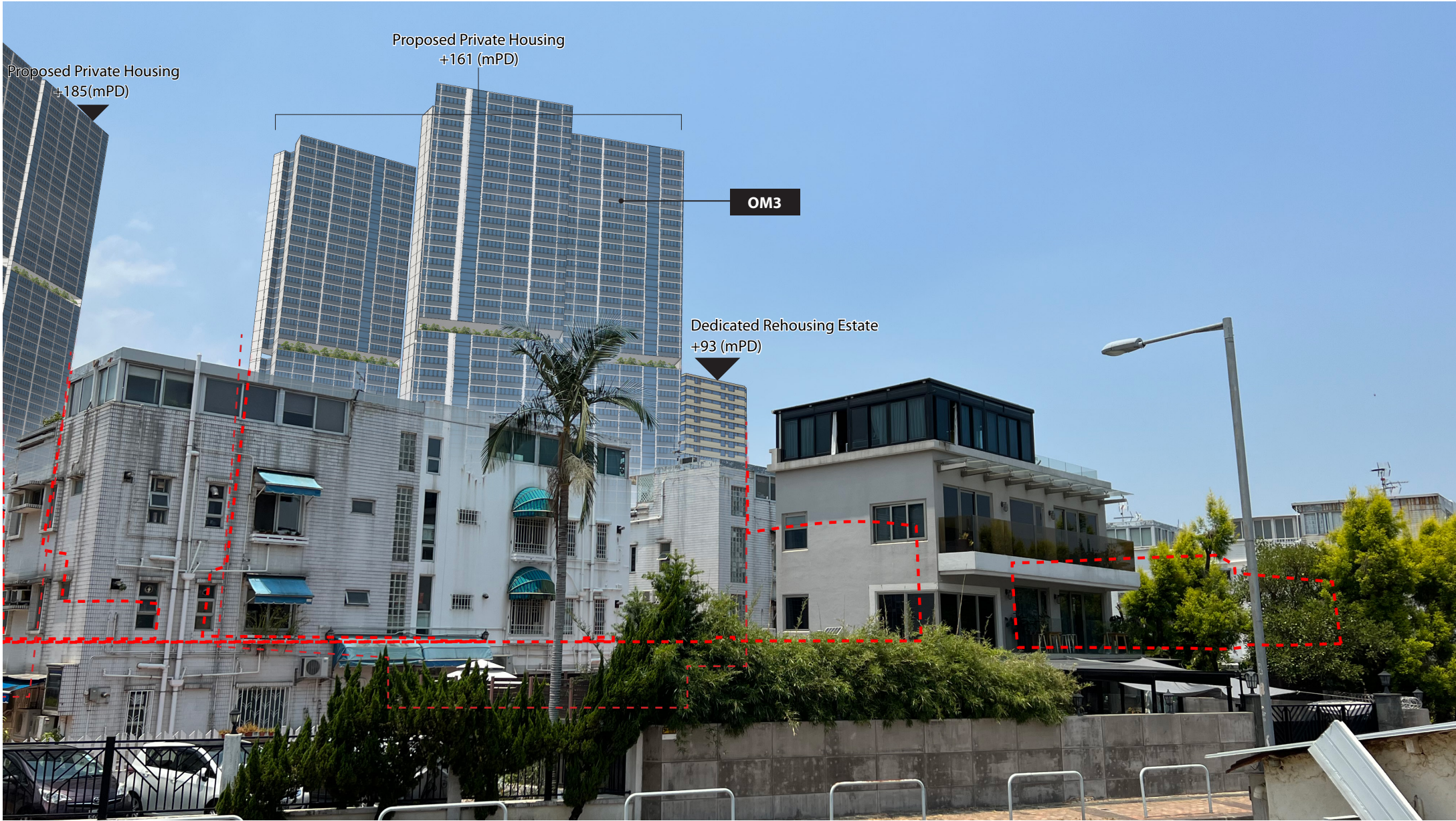
VIEWPOINT 3 - VIEW FROM WAI TSAI TSUEN PUBLIC TOILET (WITH MITIGATION MEASURES)

Note: (mPD) estimated from maximum number of building stories as per proposed floor to floor height (m), subject to changes in detailed design stage.