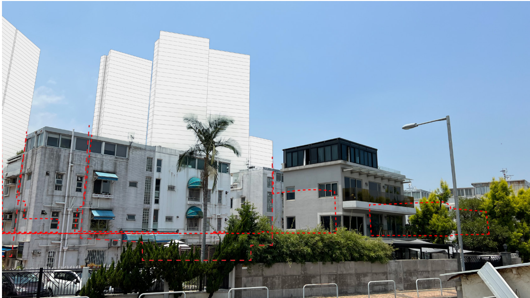
VIEWPOINT 3 - VIEW FROM WAI TSAI TSUEN PUBLIC TOILET (WITHOUT MITIGATION MEASURES)