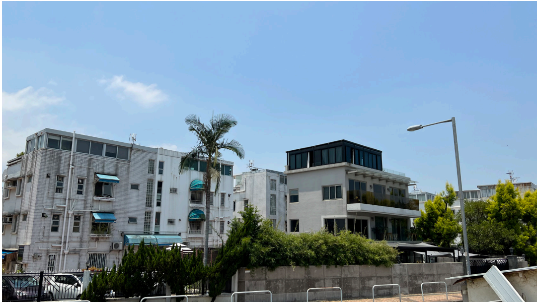
VIEWPOINT 3 - VIEW FROM WAI TSAI TSUEN PUBLIC TOILET (EXISTING BASELINE CONDITION)

ISO A1 594mm x 841mm Approved: Checked: Designer: Project Management Initials: 34/12/2021 Plot File: JWC_Hops PATH: G:\PROJECTS\60672559\DRAWINGS\KETCH\K7001.dgn