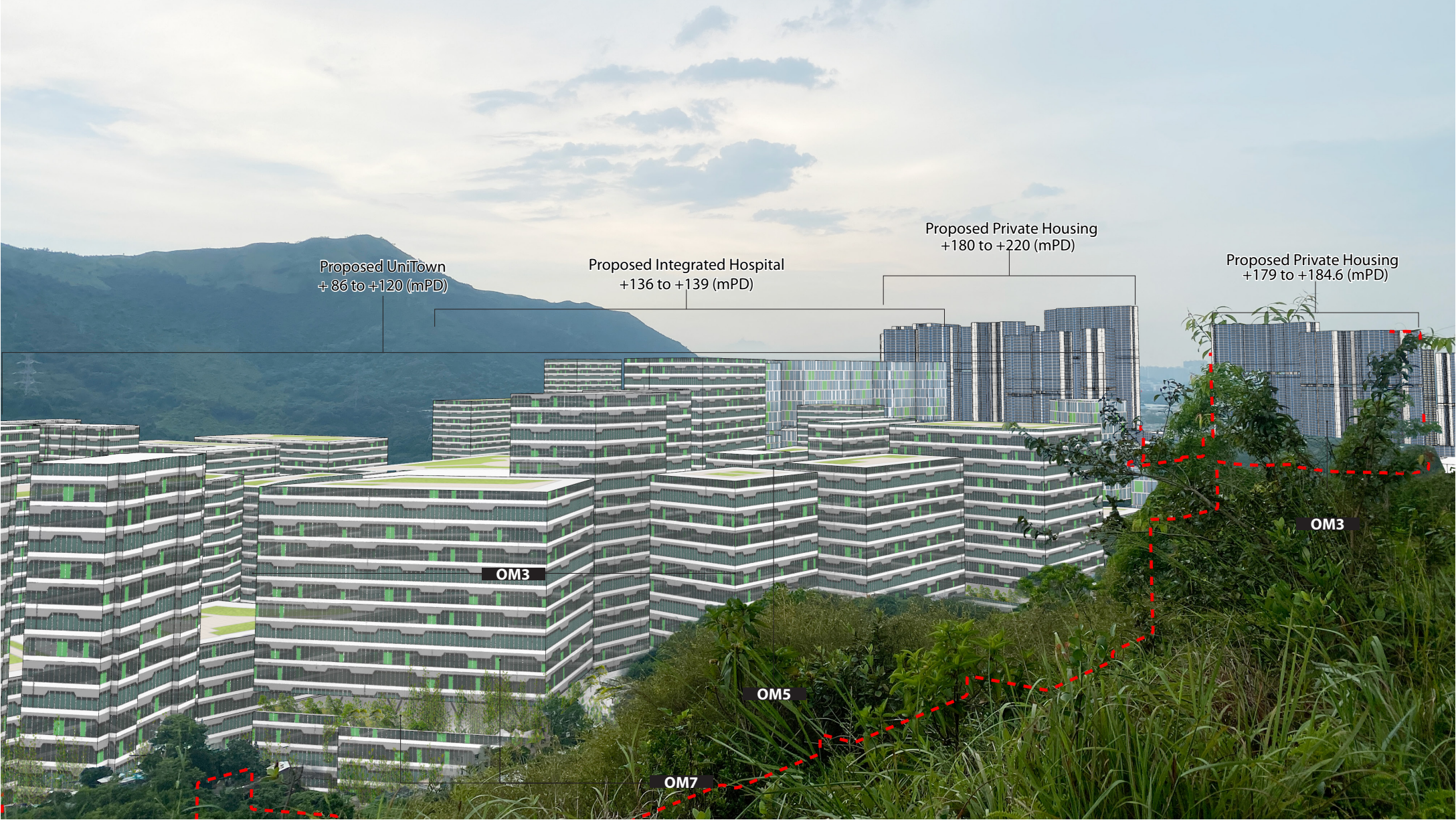
VIEWPOINT 4 - VIEW FROM HIKING TRAIL OF NGAU TAM SHAN (WITH MITIGATION MEASURES)

Note: (mPD) estimated from maximum number of building stories as per proposed floor to floor height (m), subject to changes in detailed design stage. *Operation of the proposed development is expected to end prior to the operational phase of this project.