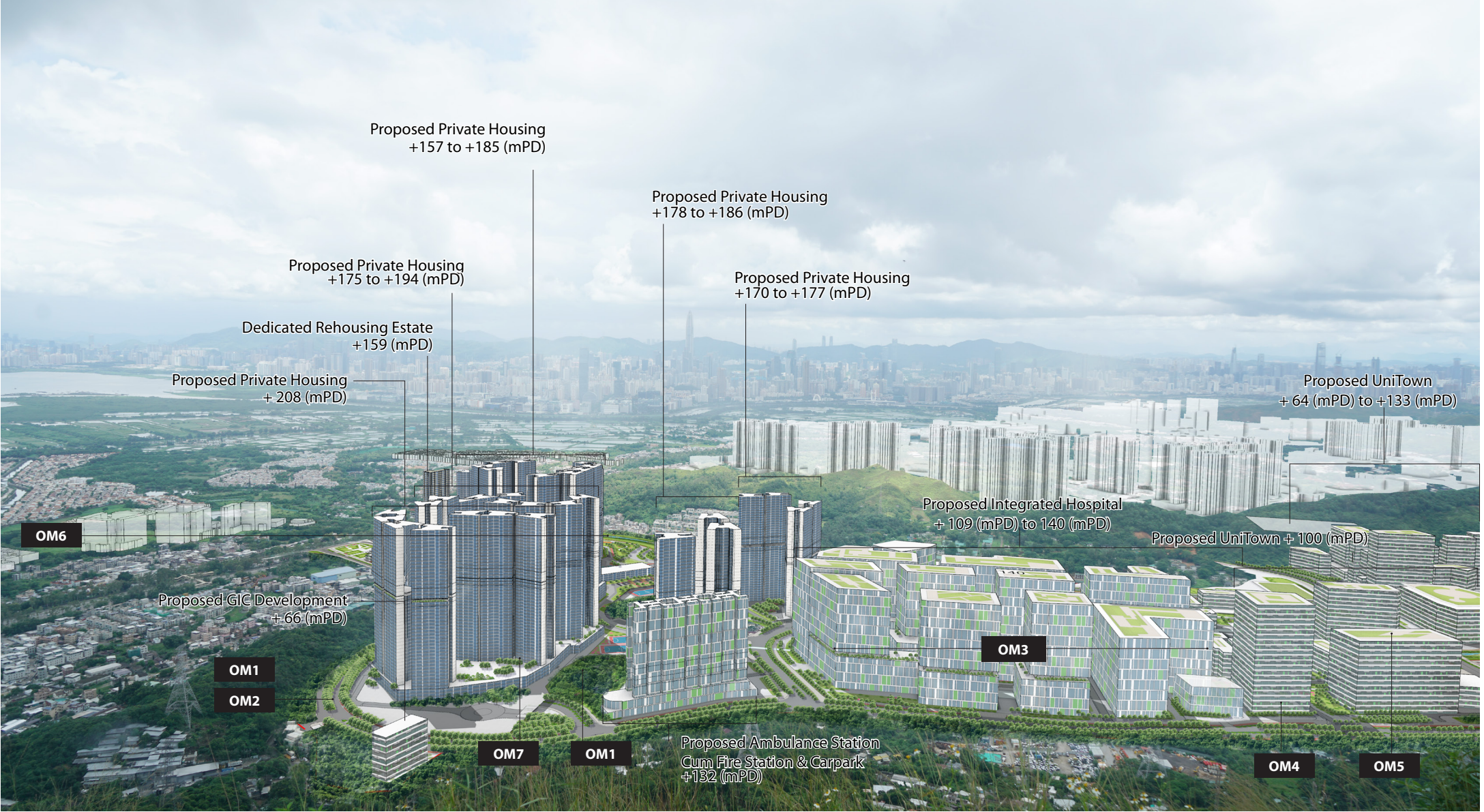
VIEWPOINT 5A - VIEW LOOKING NORTH FROM UNMAINTAINED PATH AT KAI KUNG LENG (WITH MITIGATION MEASURES)