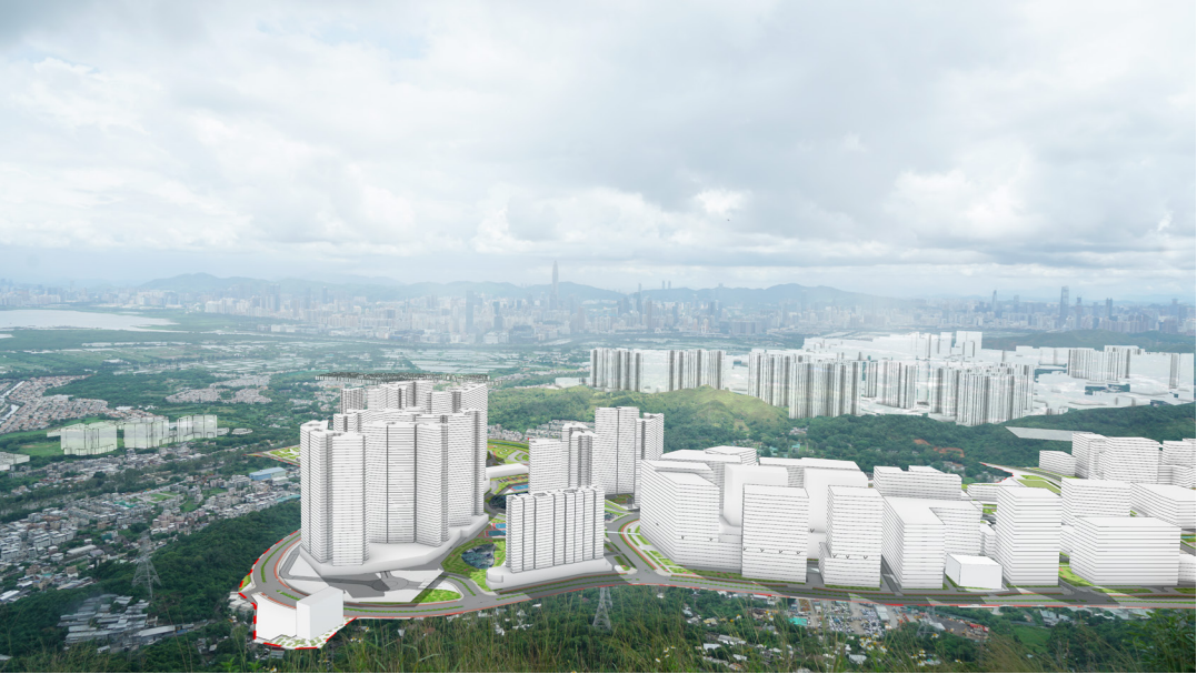
VIEWPOINT 5A - VIEW LOOKING NORTH FROM UNMAINTAINED PATH AT KAI KUNG LENG (WITHOUT MITIGATION MEASURES)