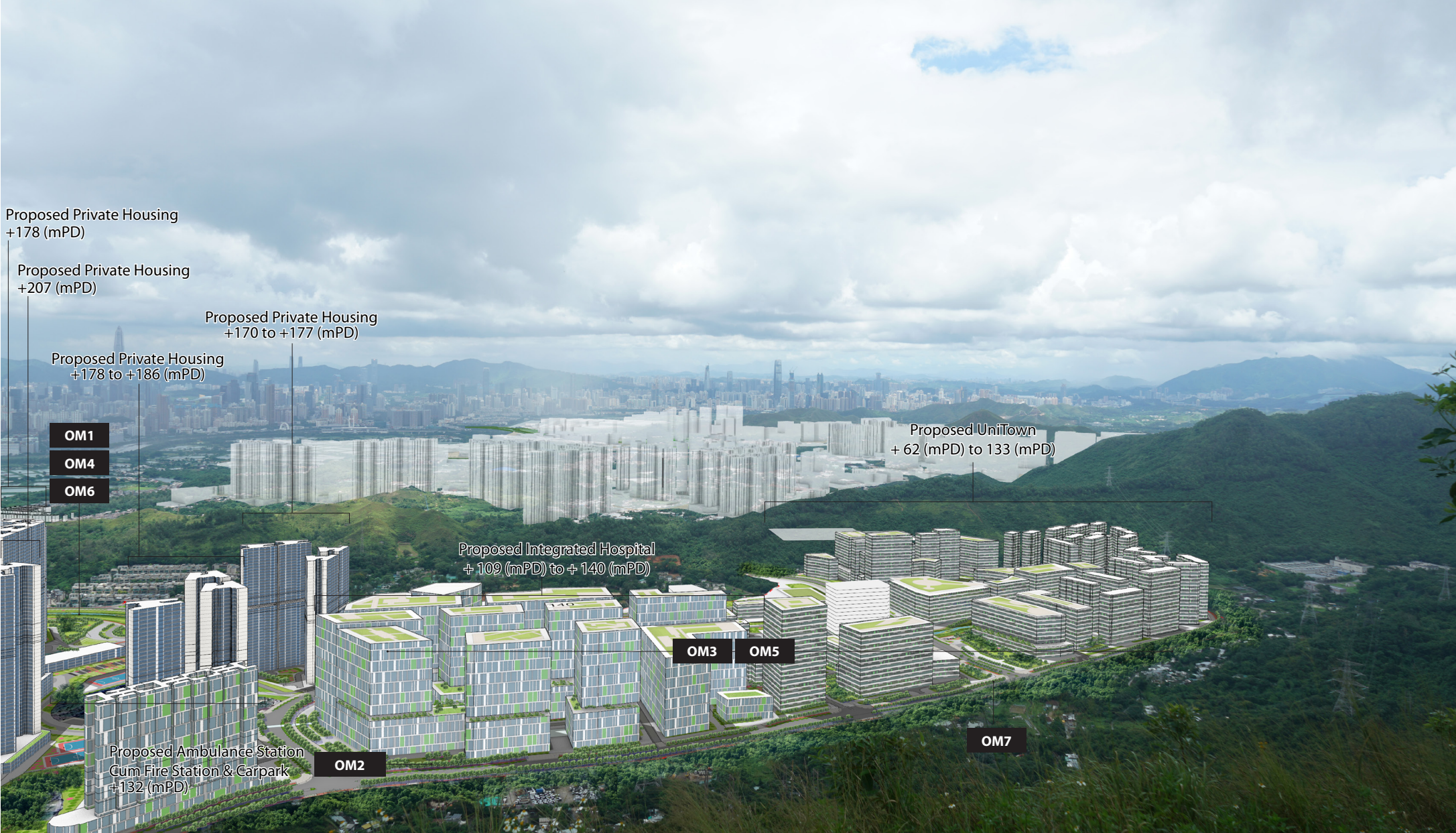
VIEWPOINT 5B - VIEW LOOKING NORTH EAST FROM UNMAINTAINED PATH AT KAI KUNG LENG (WITH MITIGATION MEASURES)

Note: (mPD) estimated from maximum number of building stories as per proposed floor to floor height (m), subject to changes in detailed design stage. *Operation of the proposed development is expected to end prior to the operational phase of this project.