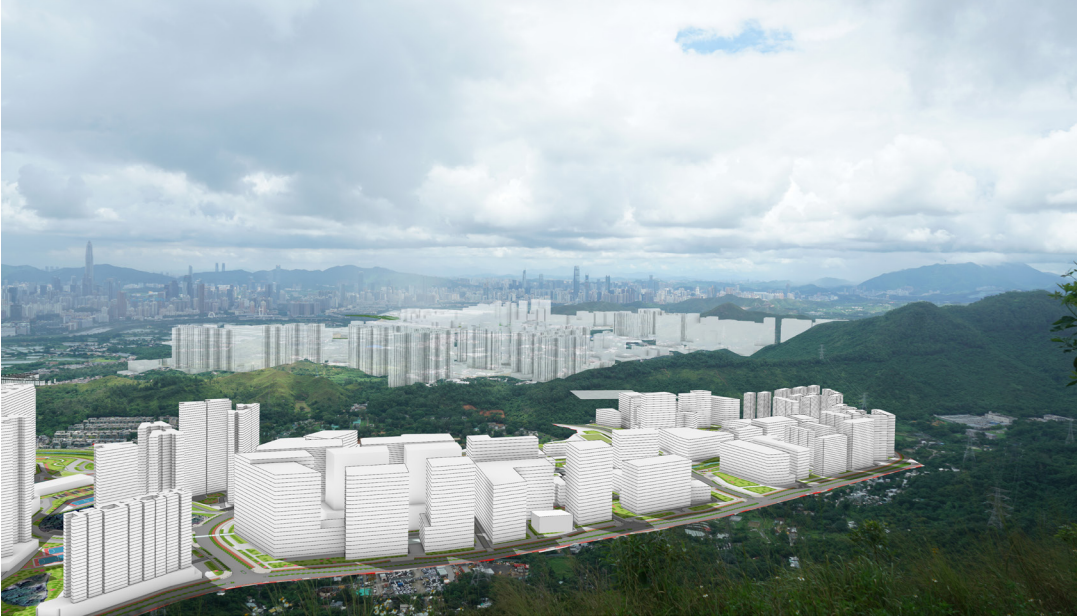
VIEWPOINT 5B - VIEW LOOKING NORTH-EAST FROM UNMAINTAINED PATH AT KAI KUNG LENG (WITHOUT MITIGATION MEASURES)