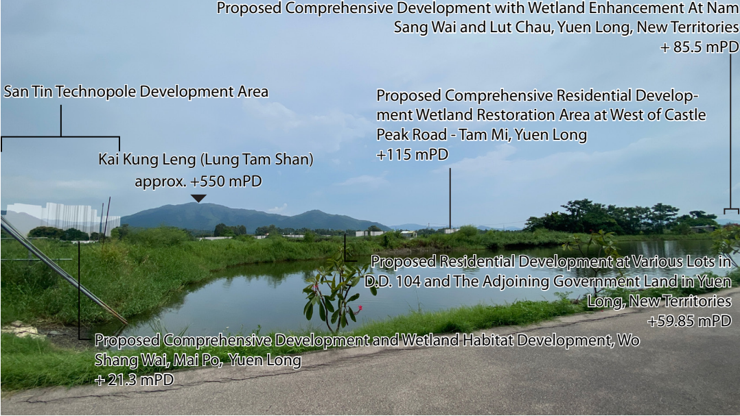
VIEWPOINT 7 - VIEW FROM TAM KON CHAU ROAD NEAR MAI PO (EXISTING BASELINE CONDITION)

ISO A1 594mm x 841mm Approved: Checked: Designer: Project Management Initials: Plot File: J:\P1_Hops_341122021 PATH: G:\PROJECTS\60672559\DRAWINGS\SKETCH\K7001.dgn