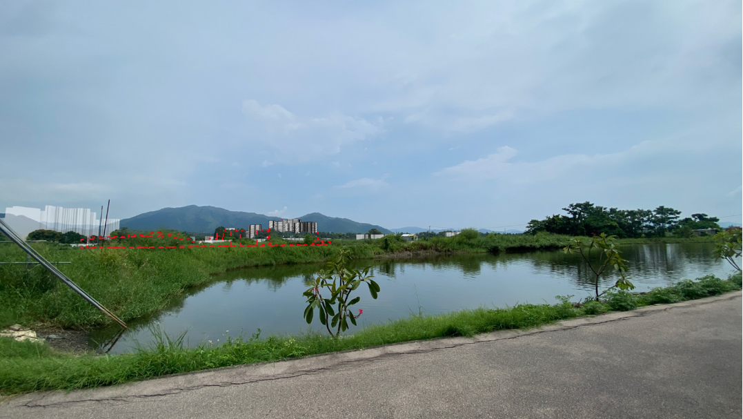
VIEWPOINT 7- VIEW FROM TAM KON CHAU ROAD NEAR MAI PO (WITHOUT MITIGATION MEASURES)