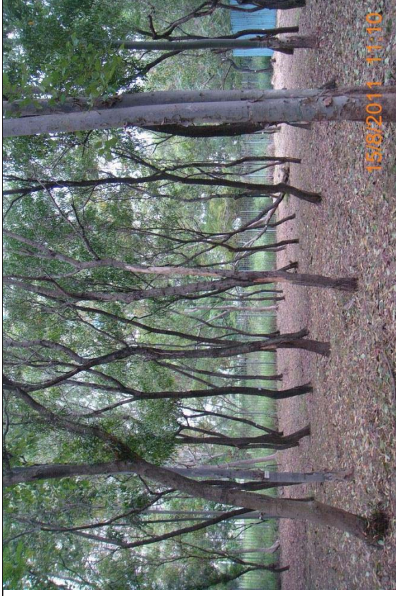
Ha Tusen Pumping Station