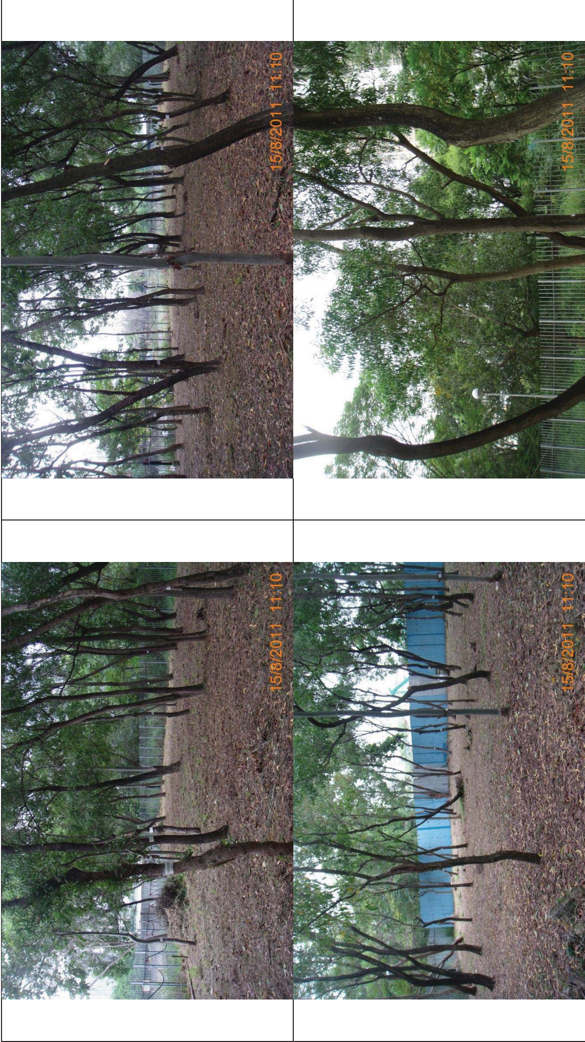
Ha Tusen Pumping Station