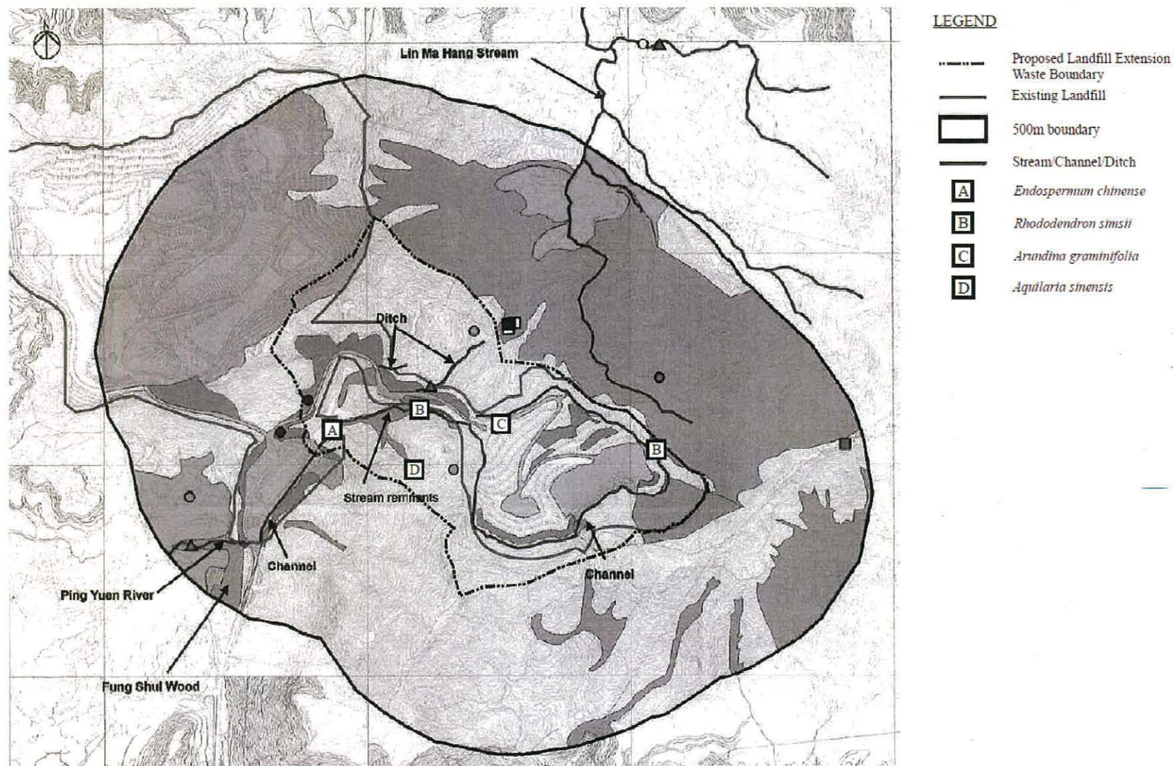
Figure 3 圖三

North East New Territories (NENT) Landfill Extension (新界東北堆填區擴建計劃) Location of Endospermum chinense , Rhododendron simsii , Arundina graminifolia and Aquilaria sinensis Mentioned in Condition 2.7 (按條件2.7 提及的 Endospermum chinense , Rhododendron simsii , Arundina graminifolia and Aquilaria sinensis 之位置圖)