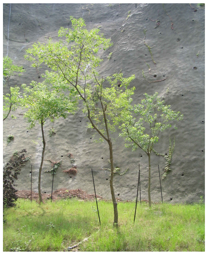
Plate No. 8 View of the newly planted trees along the slope toe