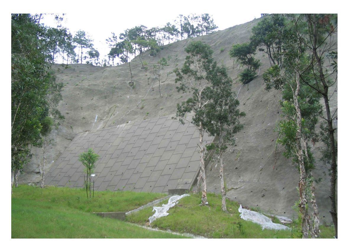
Plate No. 3 View of the colour painted slope surface and skin wall at the middle portion of the feature