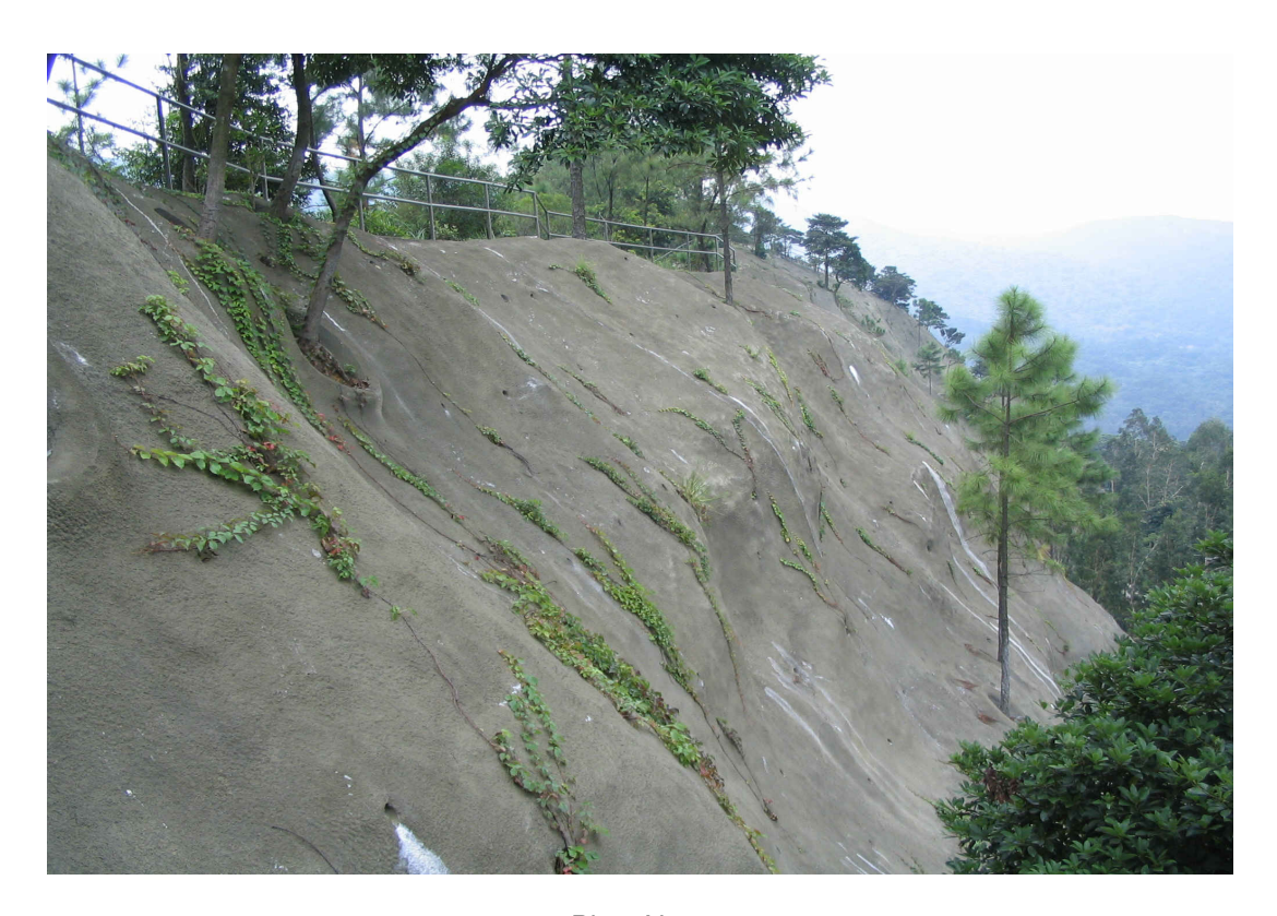
Plate No. 9 General view of the north-eastern portion of the feature