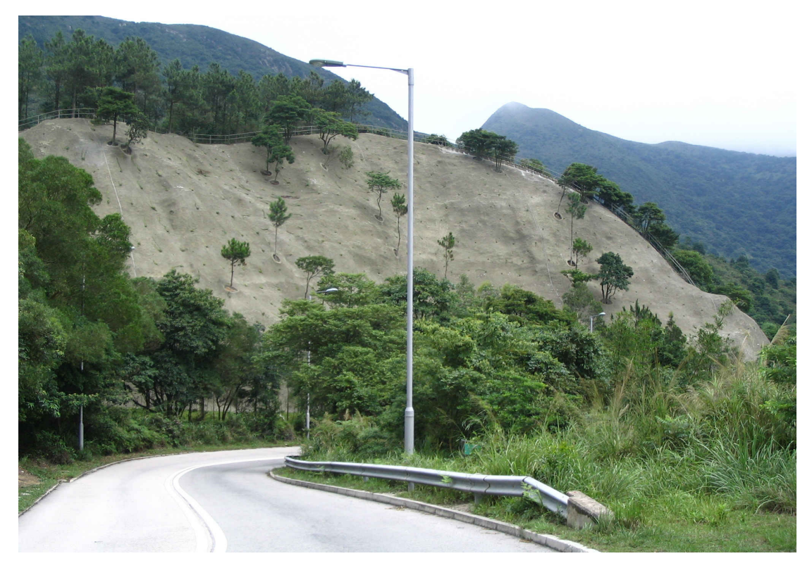
Plate No. 2 General view of the feature from Keung Shan Road