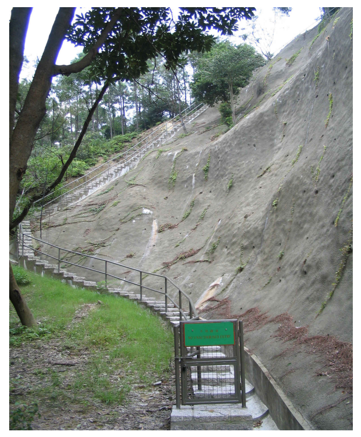
Plate No. 10 View of the north-eastern end of the feature