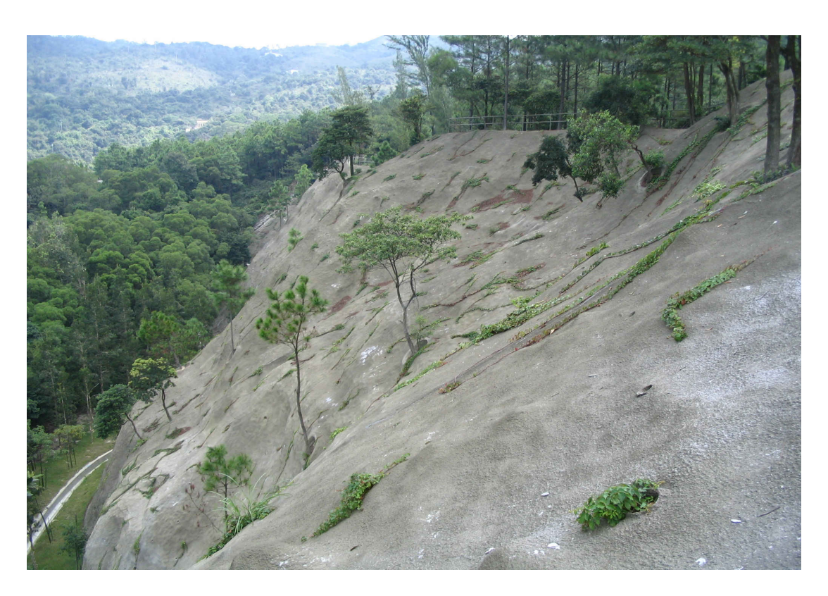
Plate No. 7 All existing trees are preserved in tree rings on the sprayed concrete slope surface