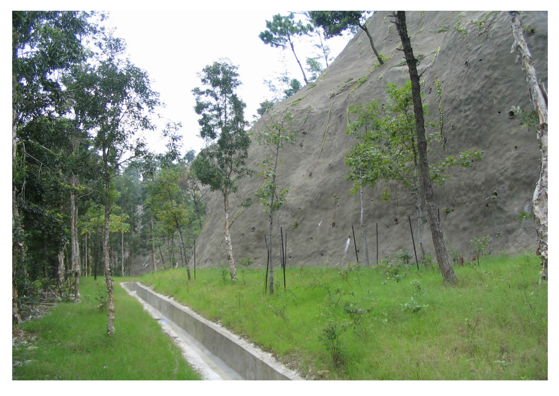
Plate No. 6 Newly planted trees and hydroseeded area along the slope toe