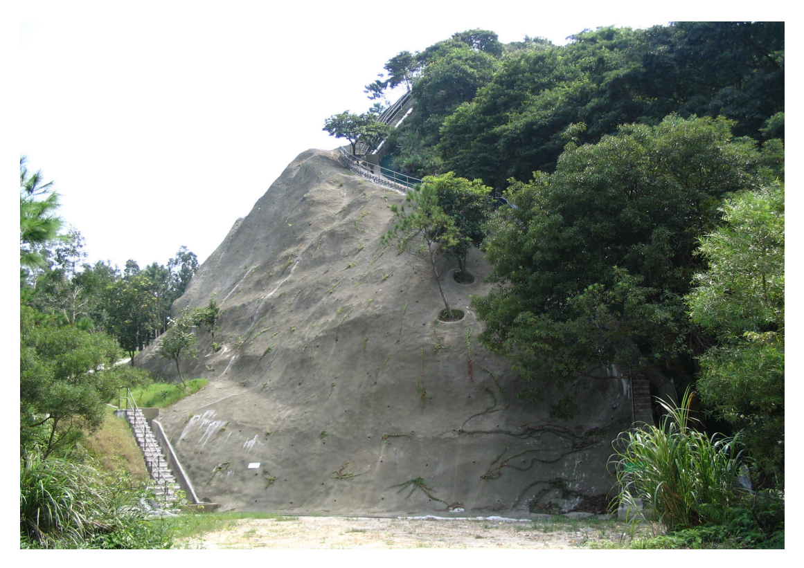
Plate No. 4 General view of the south-western end of the feature