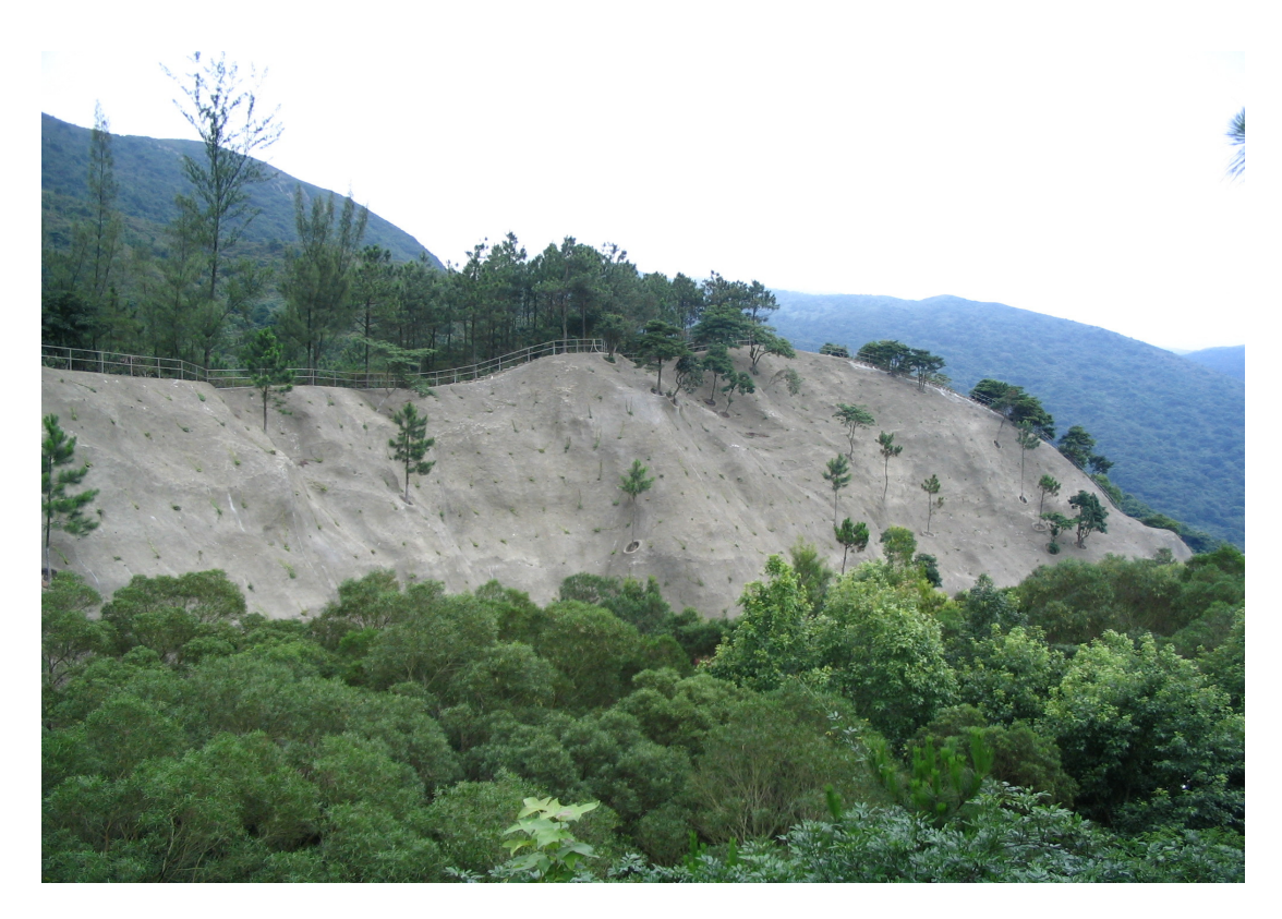
Plate No. 1 General view of the middle portion of the feature