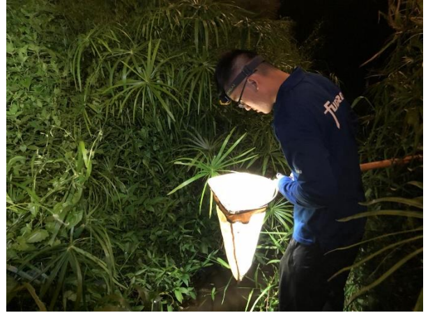
Photo 2.3: Surveyor kick-netting the substrate and checking the net's contents

2.4.3.2 Similar to hand netting, the net content was emptied on to a large sorting tray. All caught S. zanklon , if any, were carefully moved to a plastic container for post-translocation marking.