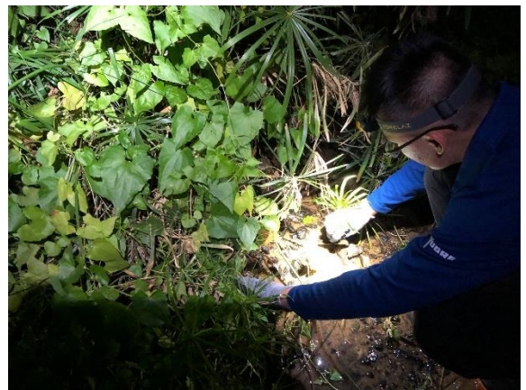
Photo 2.4: Surveyor searching for S. zanklon on potential hiding space (under vegetation) along the watercourse