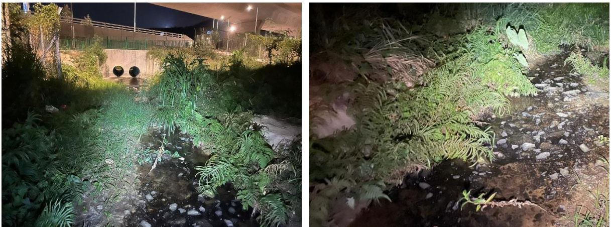
Photo 2.1: Section of the monitoring area with low gradient and low water flow

2.2.3 Although channelisation features (e.g., concrete bank and gabions) and an inflatable water dam are present about 100m to the east, the monitoring area is still considered largely natural with a low gradient and low water flow (see Photo 2.1 ). The streambed is mainly covered by soil and stream banks are vegetated with grass. This area meets the habitat requirements of the species. The soft soil stream substrate and the availability of riparian vegetation are ideal for S. zanklon to create microhabitat to inhabit. In addition, the natural meander would also reduce the water flow, which is preferred by the S. zanklon . It is anticipated that pollution or disturbance would be in a low level in this section, considering there is limited roads and houses (and therefore limited human activities) until the stream reaches Kan Tau Wai and Tong Fong along Ping Che Road.