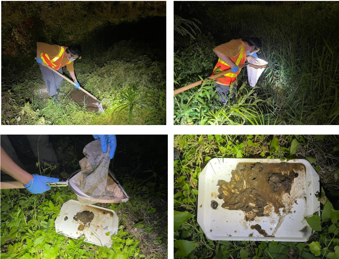
Photo 2.2: Hand netting at a potential habitat (vegetation) along the watercourse

2.4.2.1 Hand netting (see Photo 2.2) was used to search the potential habitats along the watercourse. The sweeping motion of the hand netting scraped the layer of the stream bottom substrate into the net, e.g., soil and leaf litter where possible, as S. zanklon is likely to be among these substrates. After taking the hand net out of the water, it was allowed to drain, and the net content was emptied on to a large sorting tray. All caught S. zanklon , if any, would be carefully moved to a plastic container for marking.