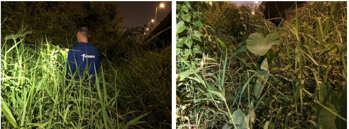
Photo 3.1: Dense growth of riparian vegetation in the monitoring area

3.1.1 There was no S. zanklon individual that was recaptured nor marked during the monitoring period ( Appendix C ). This could be attributed to the denser growth of the riparian vegetation in the monitoring area (see Photo 3.1 ). The dense vegetation could have provided further refuge and protection for the crabs, making them more difficult to capture during the monitoring activity. Moreover, the individuals could have moved to a different area in search for food and habitats. For example, areas further downstream are also suitable habitats for S. zanklon .