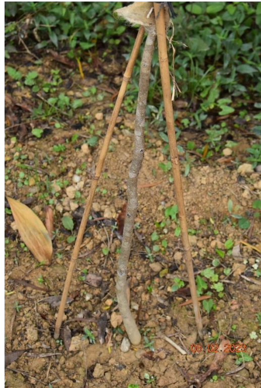
Photo B.1.2 : Stem condition of the transplanted individual AS-03.