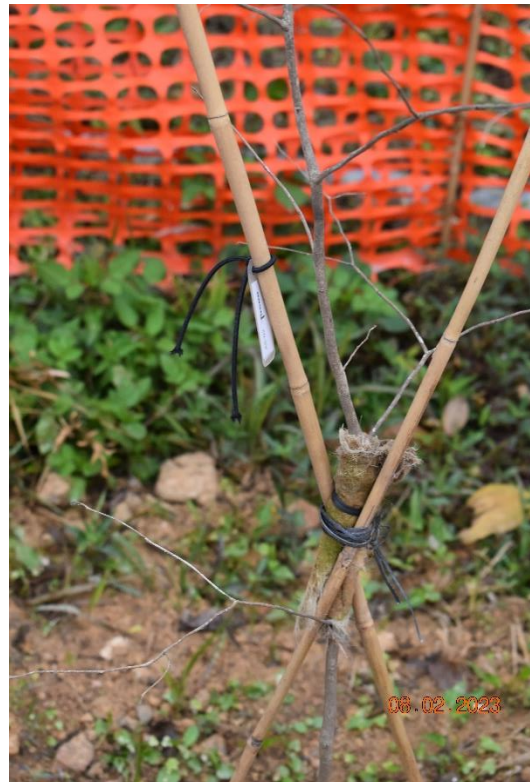
Photo B.1.4 : Branch condition of the transplanted individual AS-02.