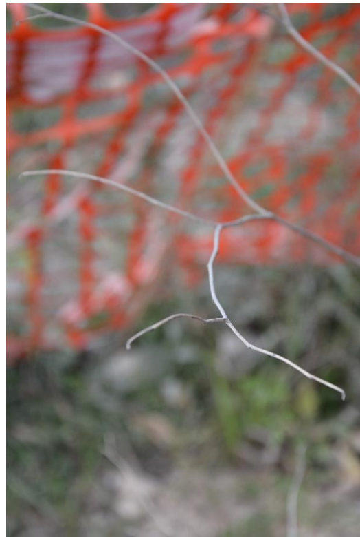
Photo B.1.4 : Branch condition of the transplanted individual AS-02.