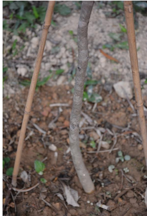
Photo B.1.2 : Stem condition of the transplanted individual AS-03.