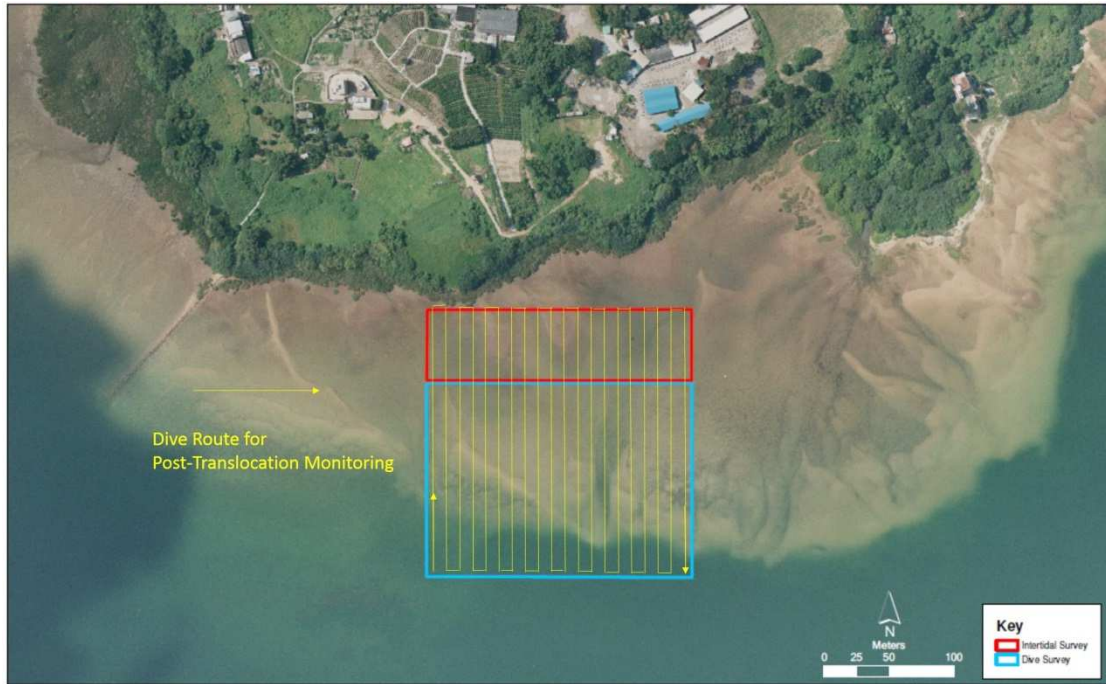
Figure 1. Original Post-Translocation Monitoring Survey Route at Ting Kok East