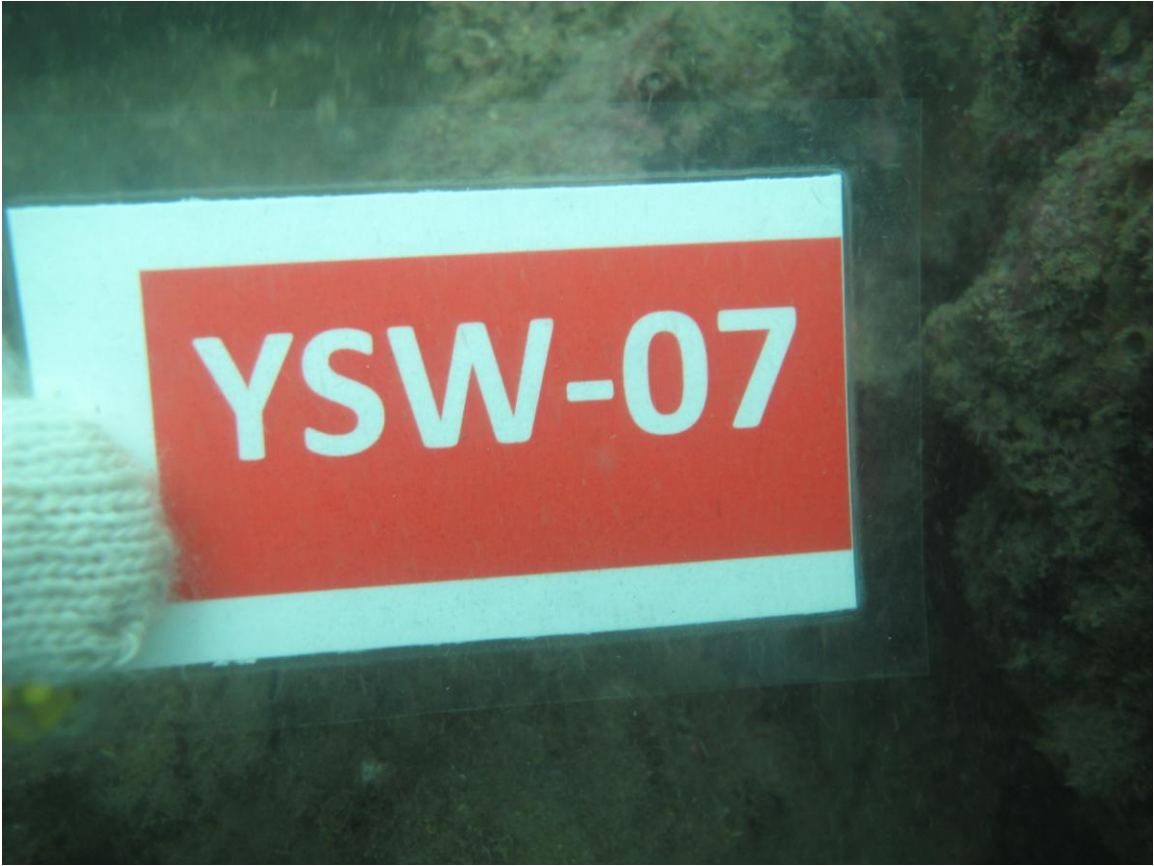
Photograph of a sample tag.