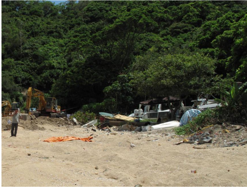
Photo 1: General refuses were found in the shore area but it is not project-related.