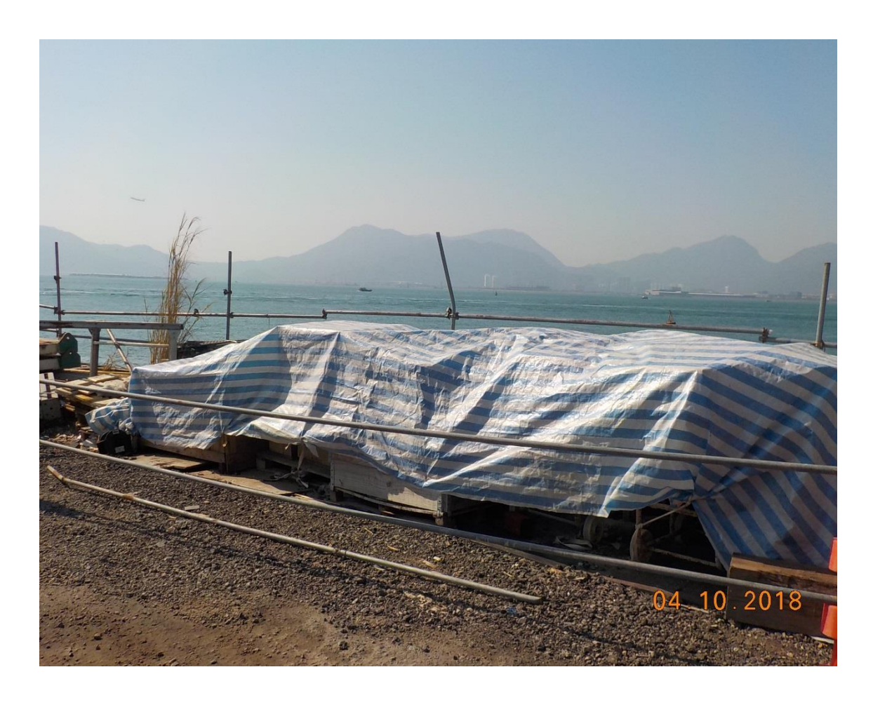
Dusty material was covered by tarpaulin sheet. (Works Area Portion N-C)