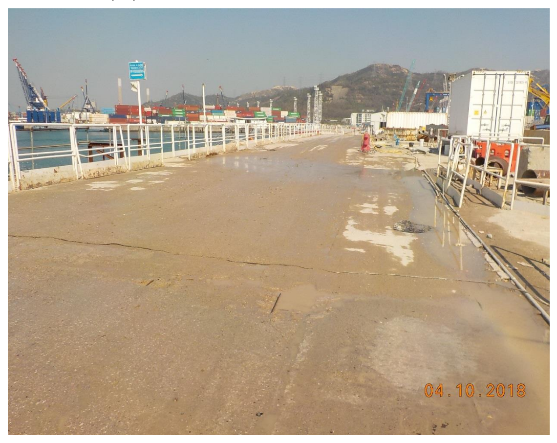
Water spraying was applied frequently on site. (Works Area Portion N-A)