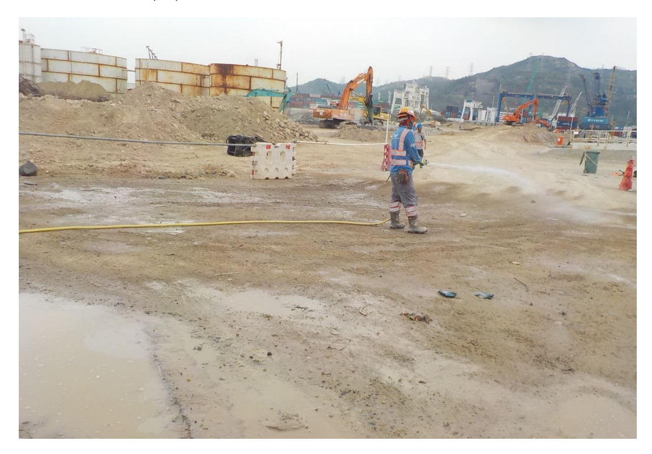
Water spraying was applied frequently on site. (Works Area Portion N-A)