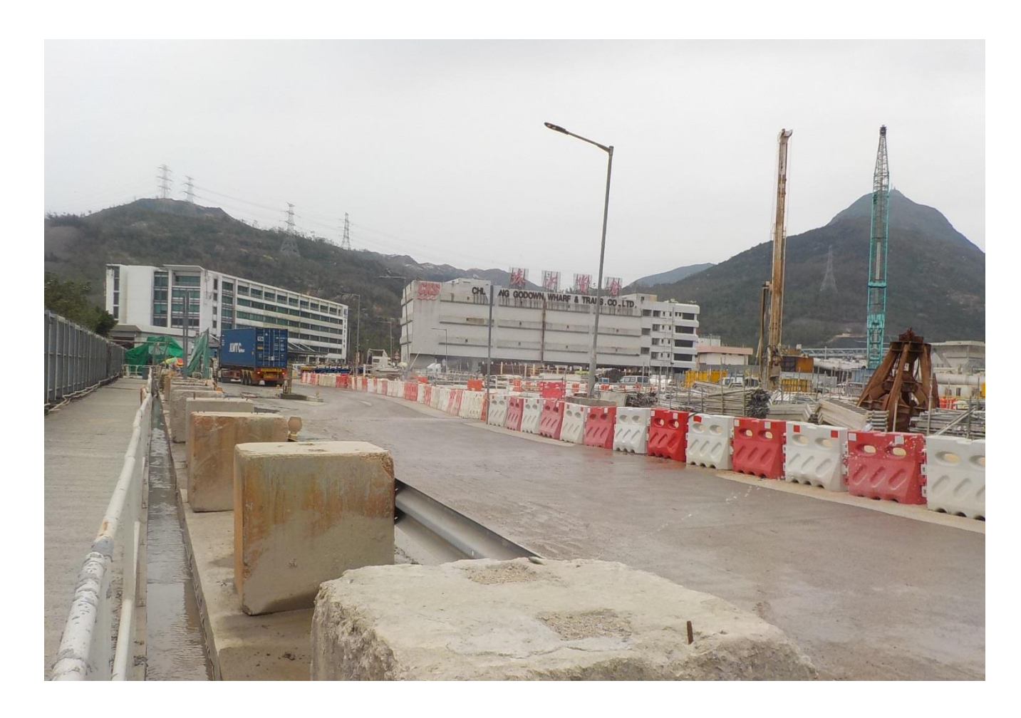
Sprinklers were installed to water the main haul road. (Works Area Portion N-A)