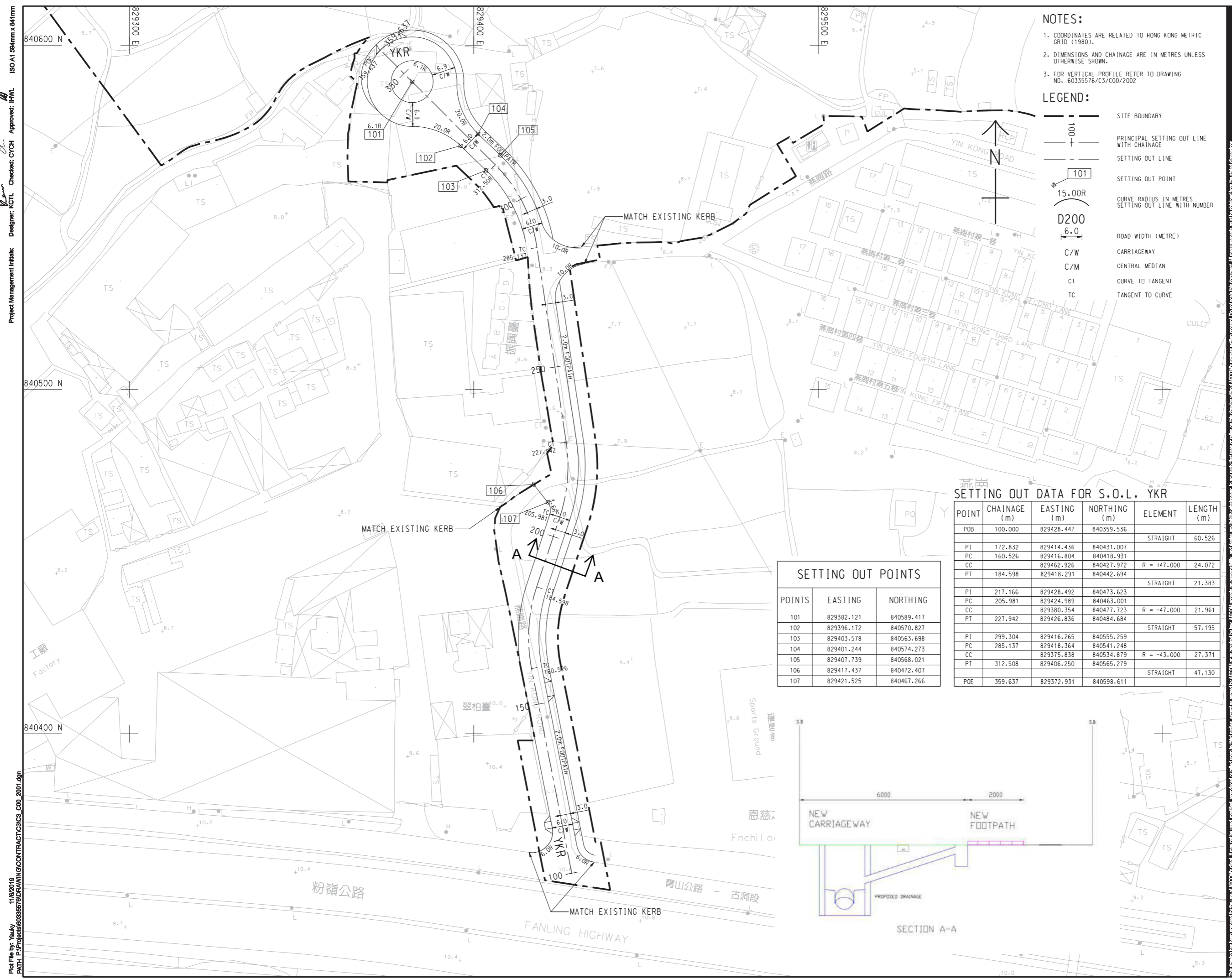
SETTING OUT DATA FOR S.O.L. YKR

PROJECT NO. 60335576 CONTRACT NO. ND/2019/03 SHEET TITLE YIN KONG ROAD - ROAD SETTING OUT PLAN SHEET NUMBER 60335576/C3/C00/2001