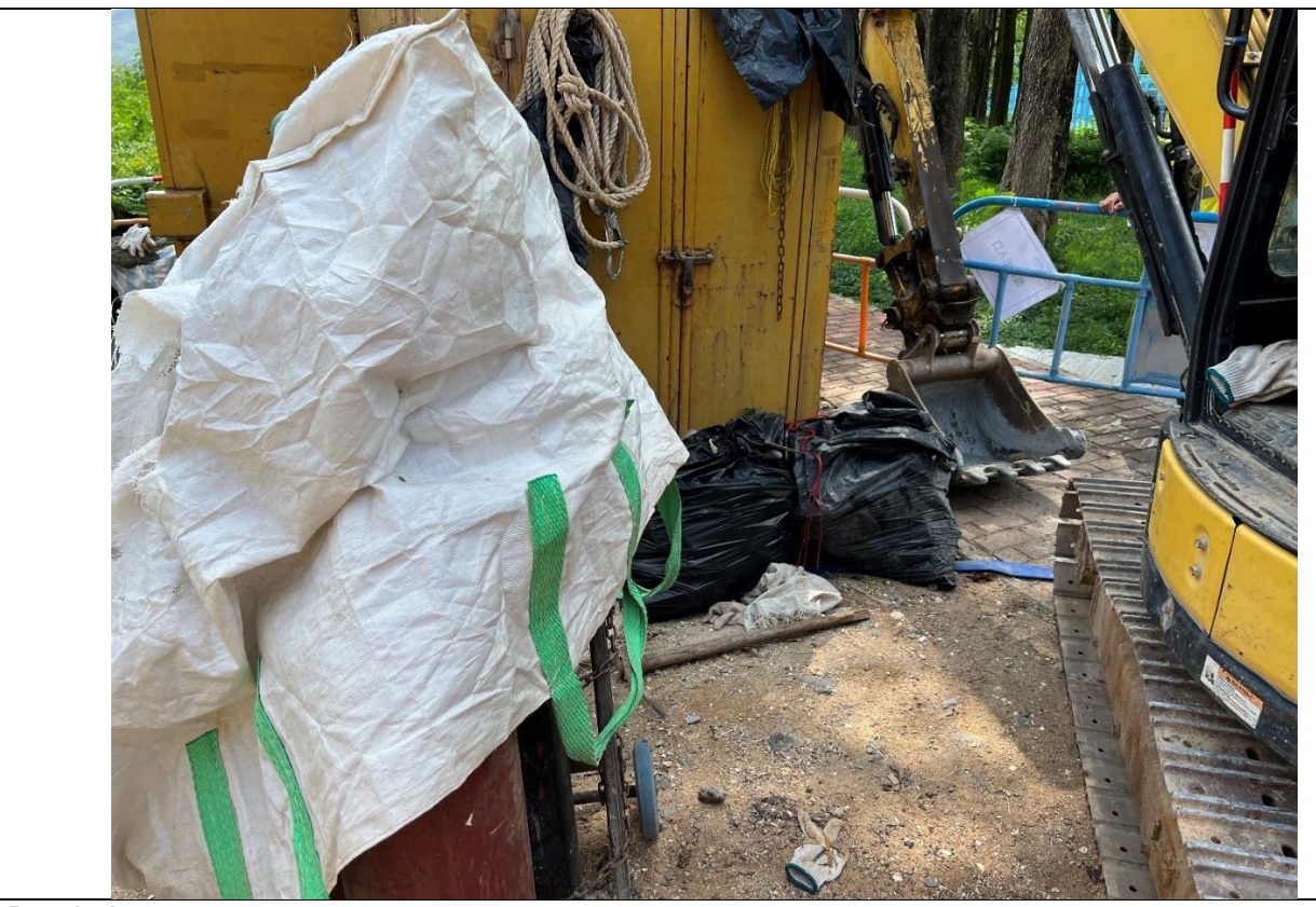
Reminder 1: The general refuse should be cleared regularly (Shun Hing Street)