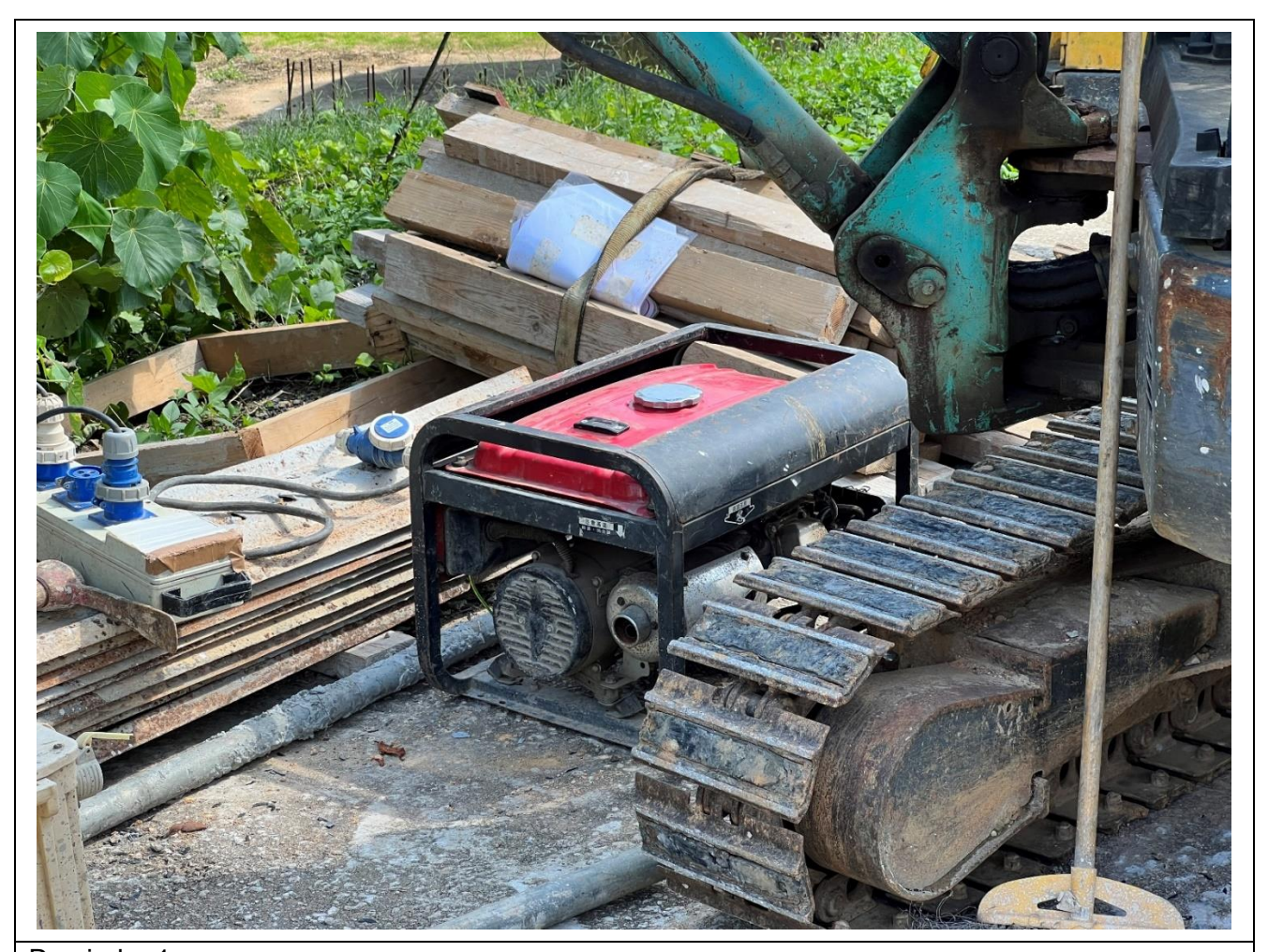
Reminder 1: The Contractor was reminded that the idling generator should be shut down between work periods to minimize the noise nuisance (Tong To)