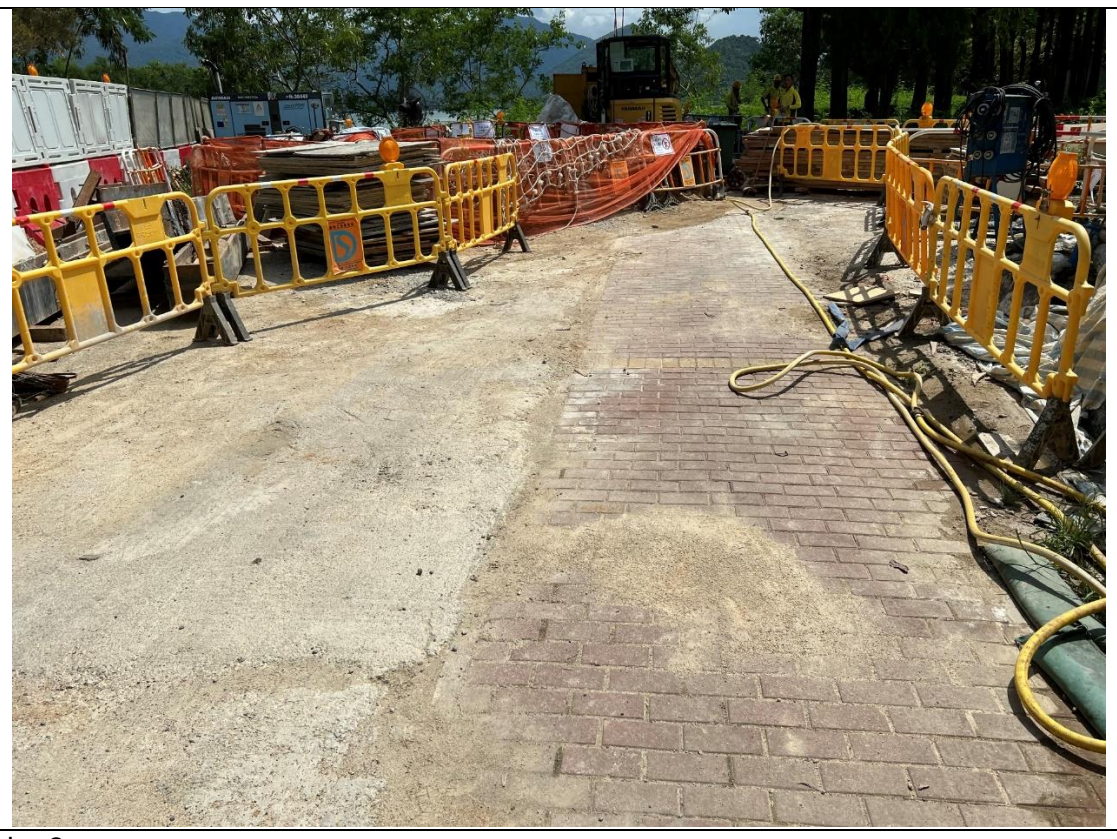
Reminder 2: Frequency of water spray should be increased on the haul road (Shun Hing Street)