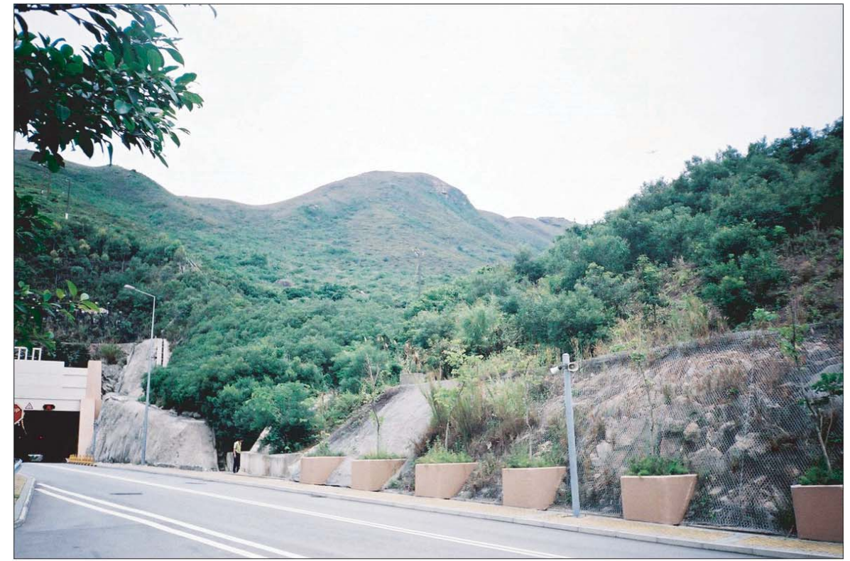
LR3 已修整斜坡 Modified Slopes