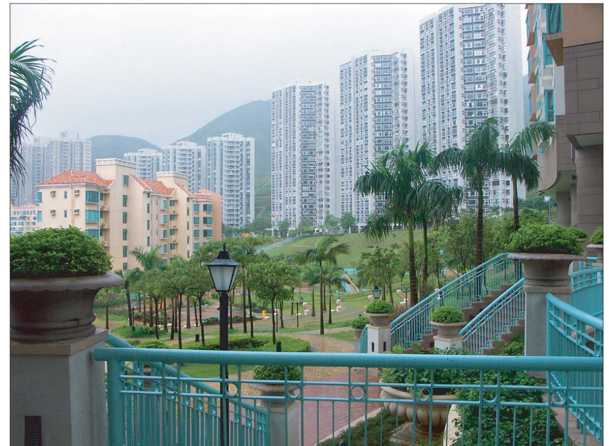
LR5 都市空間 Urban Open Space