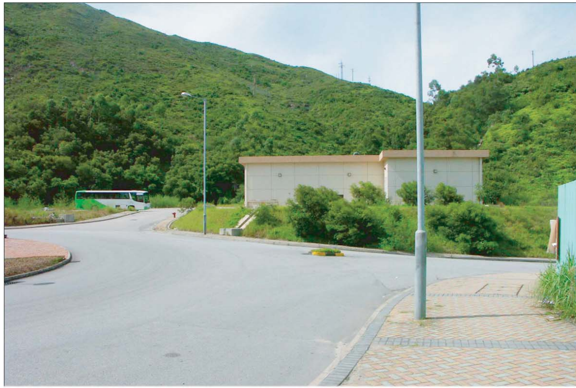
LR1 天然斜坡及林地 Natural Slopes & Woodland