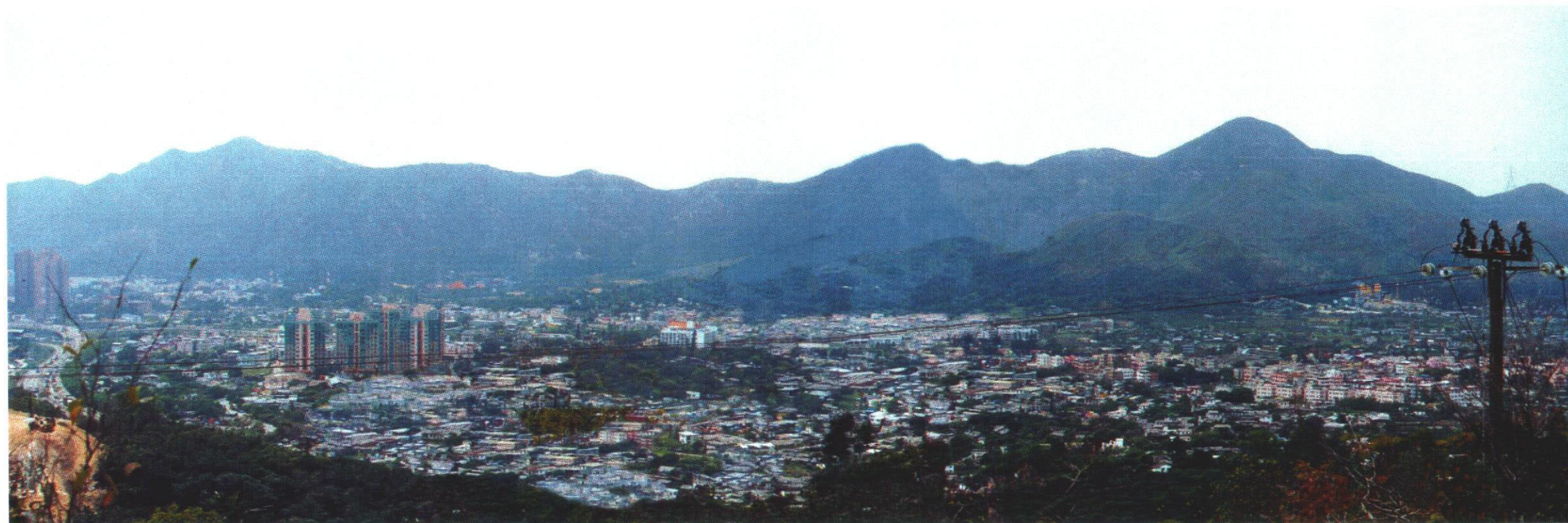
Photo View No. 1.1 Viewed from Quarry - Existing Condition