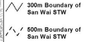
Figure 1.10 Study Boundary around the Proposed San Wai STW

Agreement No. CE62/2000 EIA Study for the Upgrading and Expansion of San Wai Sewage Treatment Works and the Expansion of Ha Tsuen Pumping Station