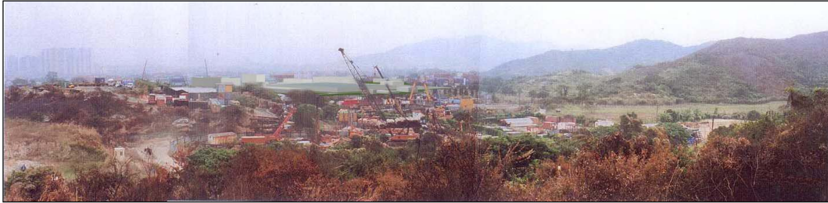
a. With no mitigation