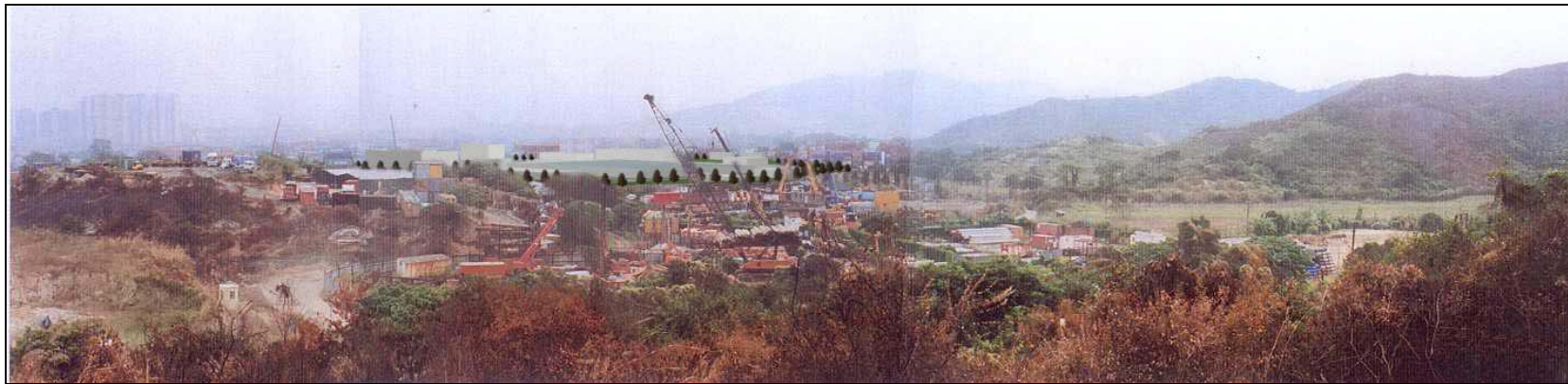
b. With mitigation at start of operation