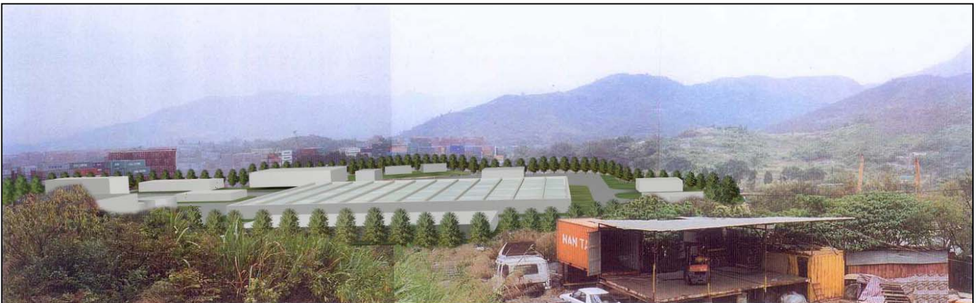
c. With mitigation after 10 years operation