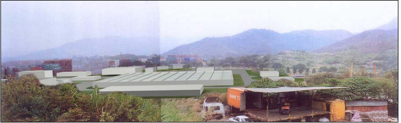
a. With no mitigation