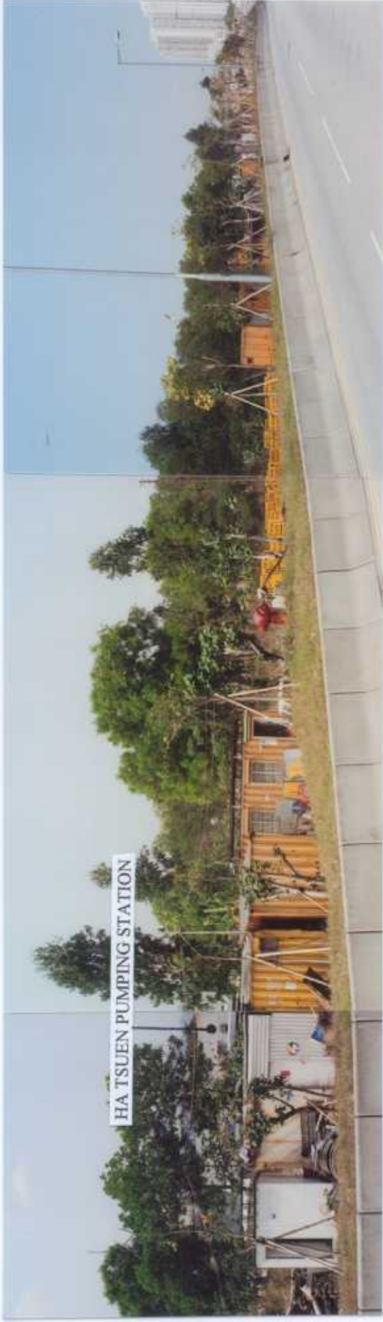
Viewpoint No. 3: Low-level view of Ha Tsuen Pumping Station from hard shoulder of Tin Ying Road showing screening effect of existing boundary and amenity roadside trees