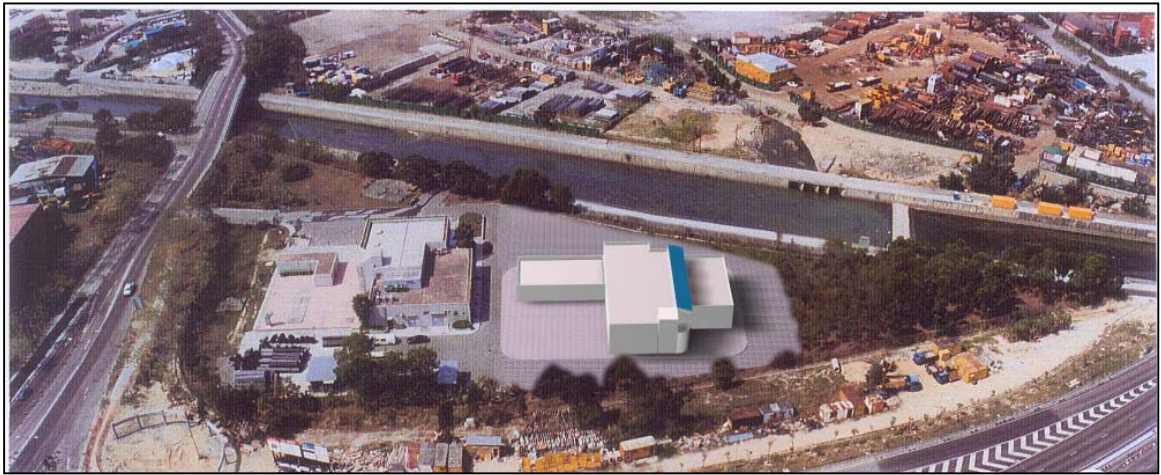
a. With no mitigation