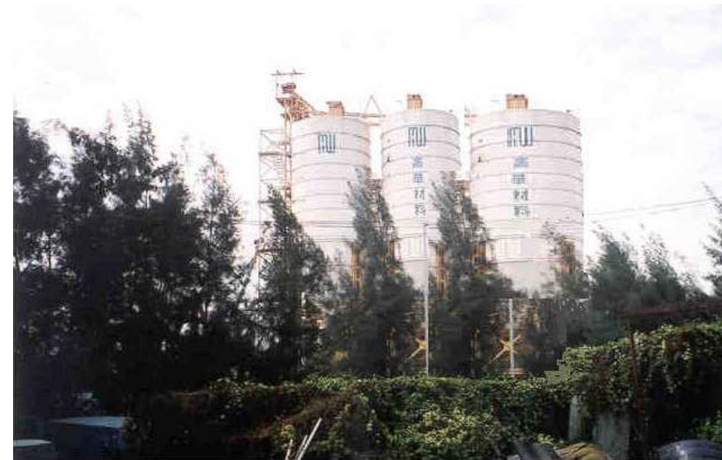
Figure 2b Photomontage showing view from Casa Marina III (VSR 1) towards the site (after the project without visual impact mitigation measures).