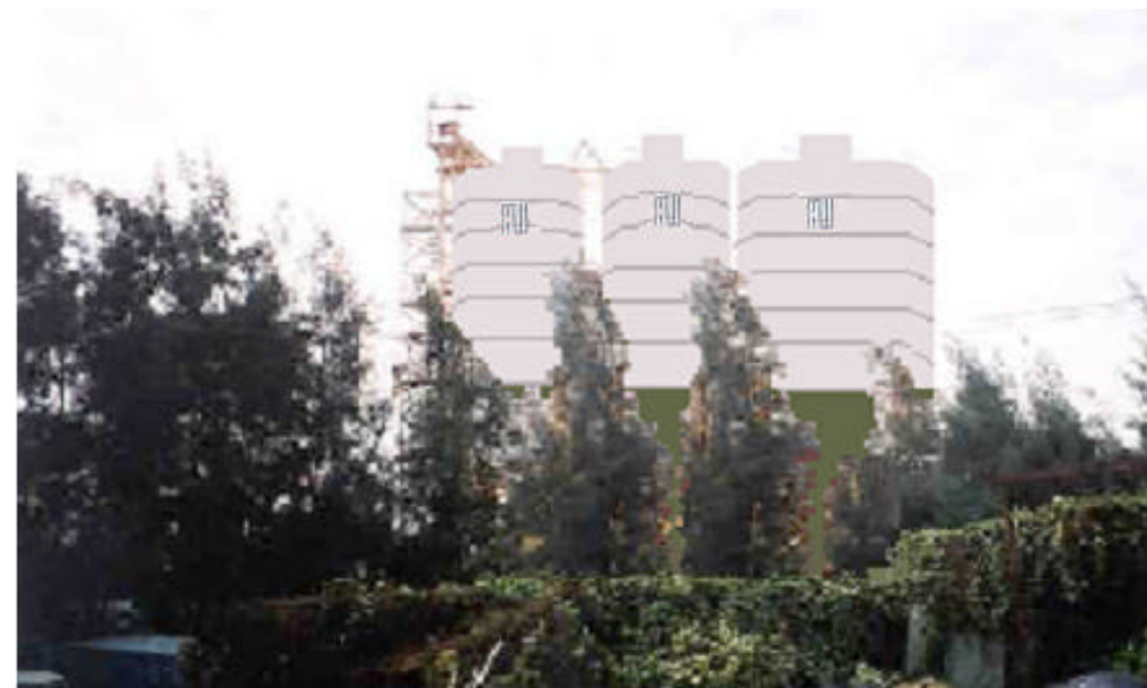
Figure 2c Photomontage showing view from Casa Marina III (VSR 1) towards the site (after the project with visual impact mitigation measures option A).