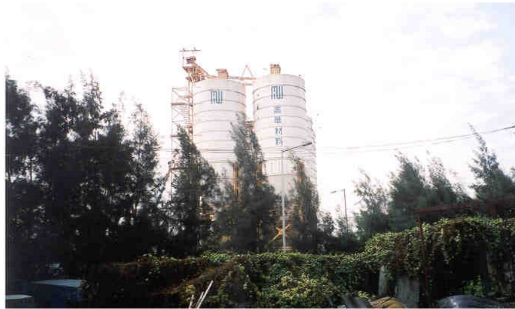
Figure 2a Photo showing view from Casa Marina III (VSR 1) towards the site (prior the project).