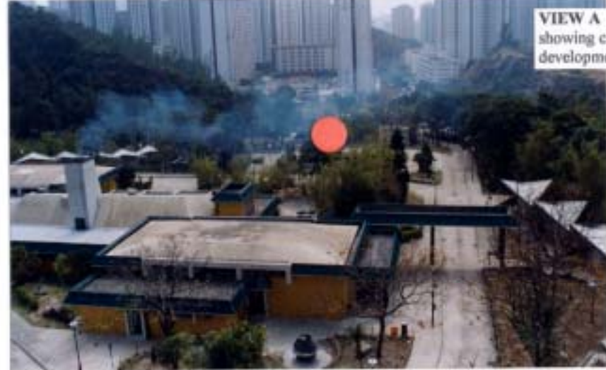
VIEW A Close, elevated view from columbarium showing crematorium in foreground and proposed development site behind (centred on red dot)