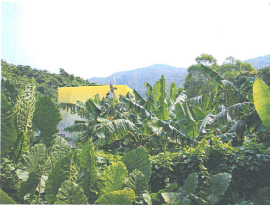
Photomontage of KV 3 without Mitigation Measures