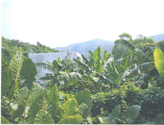
Existing View of KV 3