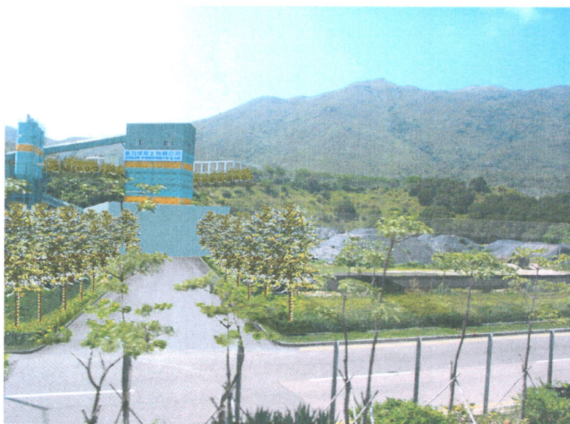
(Alternative Option) KV 1a - DAY 1 OF THE OPERATION WITH MITIGATION MEASURES

Trees and shrubs would be well-grown in entrance amenity area at both sides of the access at the proposed SHW Raw Water Booster Pumping Station & Compensatory Planting of trees along the site boundary at the proposed SHW WTW Extension for effective visual screening