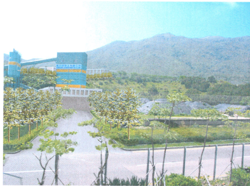
KV 1a - DAY 1 OF THE OPERATION WITH MITIGATION MEASURES