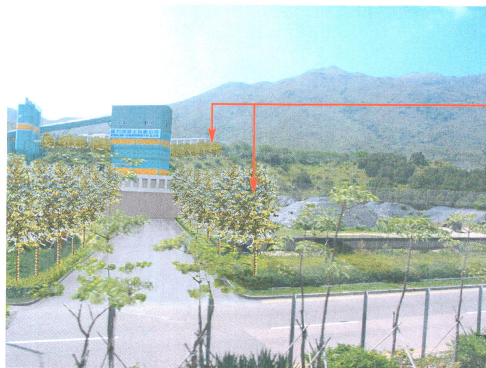
KV 1a - PROPOSED SHW RAW WATER BOOSTER PUMPING STATION YEAR 10 OPERATION WITH MITIGATION MEASURES

Trees and shrubs would be well-grown in entrance amenity area at both sides of the access at the proposed SHW Raw Water Booster Pumping Station & Compensatory Planting of trees along the site boundary at the proposed SHW WTW Extension for effective visual screening