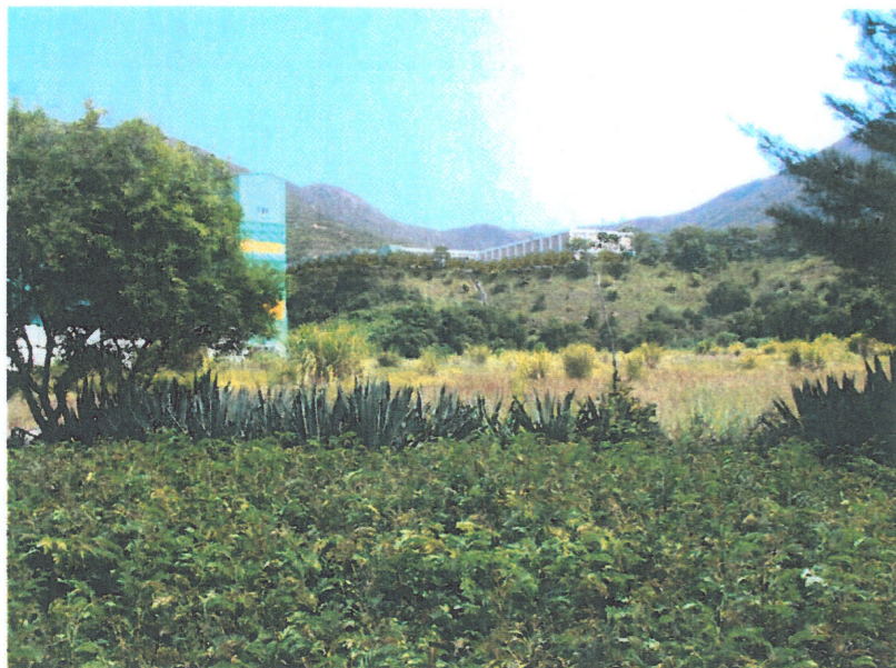
(Alternative Option) KV 2 - DAY 1 OF THE OPERATION WITH MITIGATION MEASURES

The proposed SHW WTW Extension - Oxygen Generation Plant in the front and Ozonation building at the back would be effectively screened by the well-grown trees