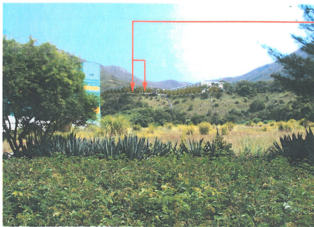
KV 2 - PROPOSED SHW WTW EXTENSION YEAR 10 OPERATION WITH MITIGATION MEASURES

The proposed SHW WTW Extension - Oxygen Generation Plant in the front and Ozonation building at the back would be effectively screened by the well-grown trees