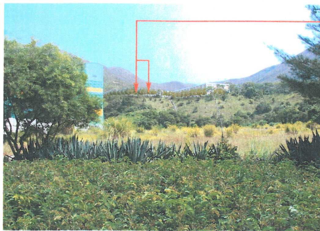
KV 2 - PROPOSED SHW WTW EXTENSION YEAR 10 OPERATION WITH MITIGATION MEASURES

The proposed SHW WTW Extension - Oxygen Generation Plant in the front and Ozonation building at the back would be effectively screened by the well-grown trees