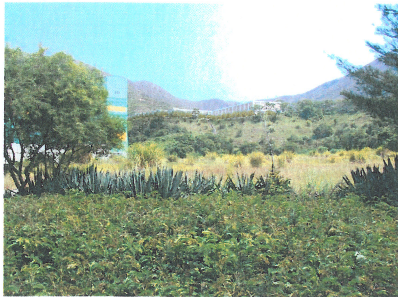
KV 2 - DAY 1 OF THE OPERATION WITH MITIGATION MEASURES