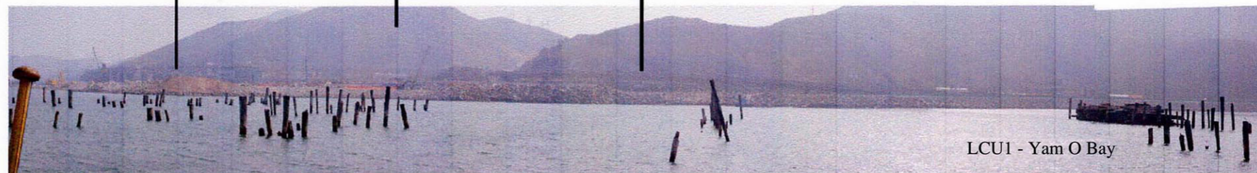
LCU1 - Yam O Bay