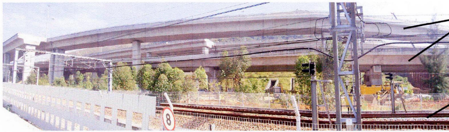
LCU2 - Existing Link Roads