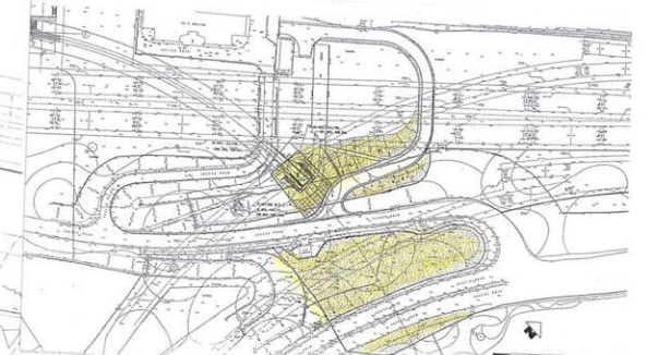
Plan - Landscape Work by MTRC at North Portal

Title Road P1 Advance Works at Yam O on Lantau Island Landscape Layout Plan