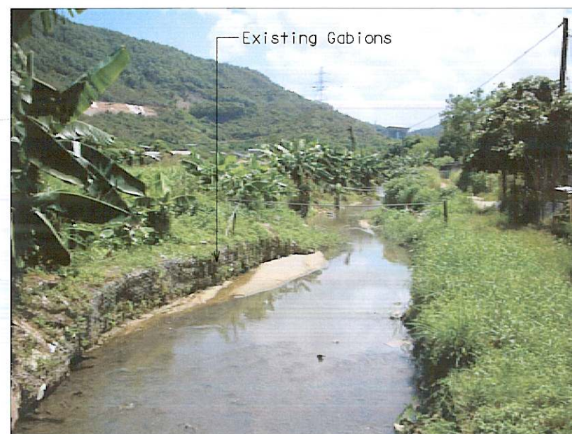
Photo No. B6 - LCA3 River / Stream Landscape Character Area