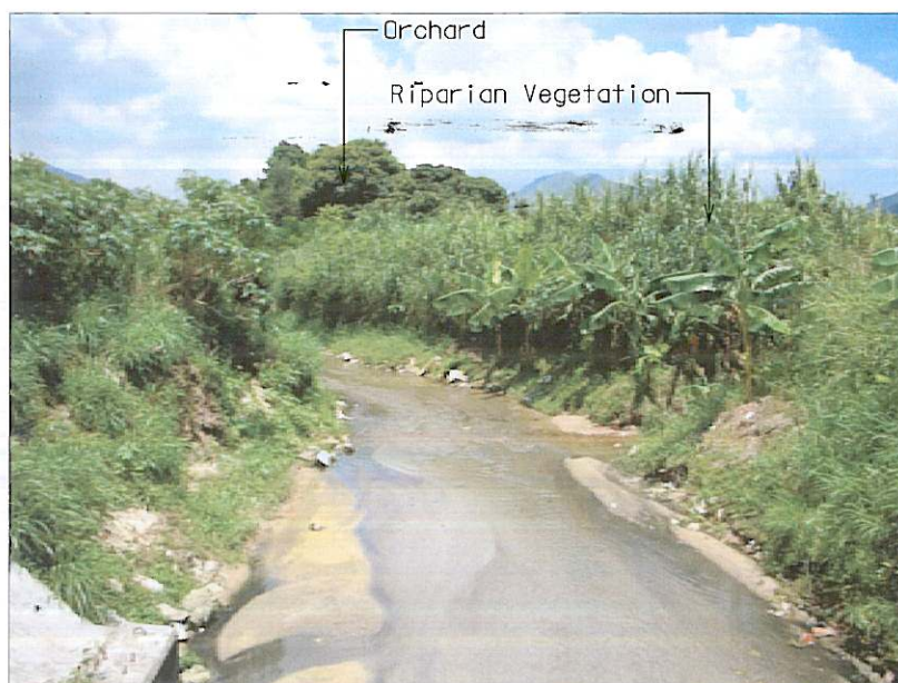
Photo No. B5 - LCA3 River / Stream Landscape Character Area