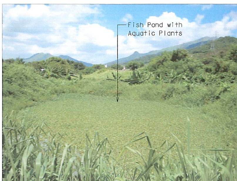
Photo No. B8 - LCA4 Fish Pond Landscape Character Area