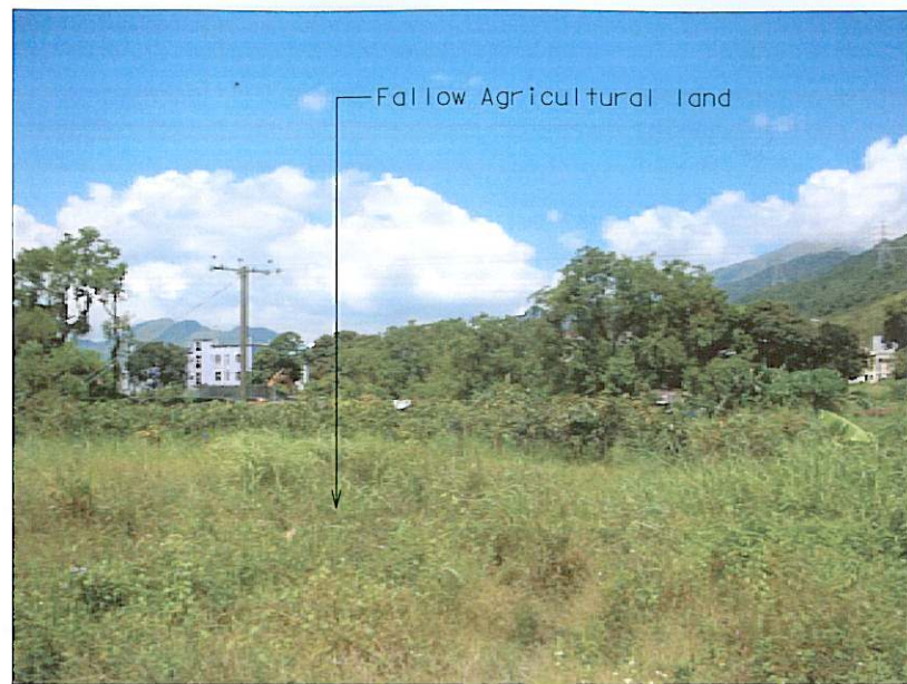
Photo No. B1 - LCA1 Agricultural Landscape Character Area