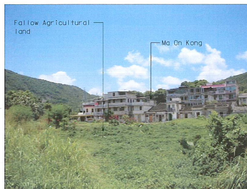
Photo No. B9 - LCA5 Village Landscape Character Area