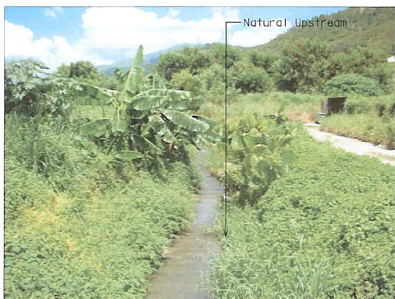
Photo No. B7 - LCA3 River / Stream Landscape Character Area