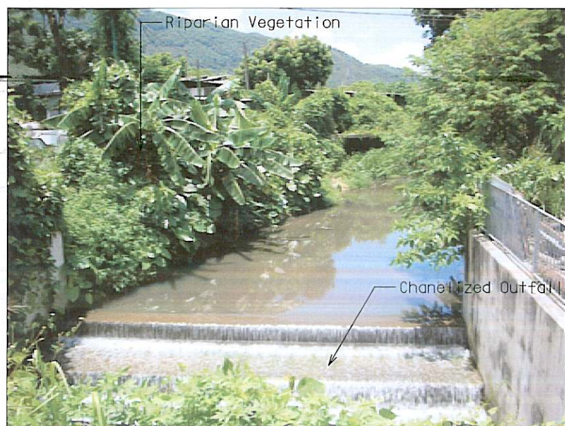
Photo No. B4 - LCA3 River / Stream Landscape Character Area