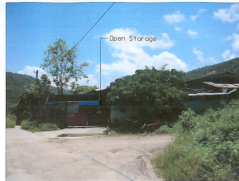
Photo No. B12 - LCA6 Industrial Landscape Character Area