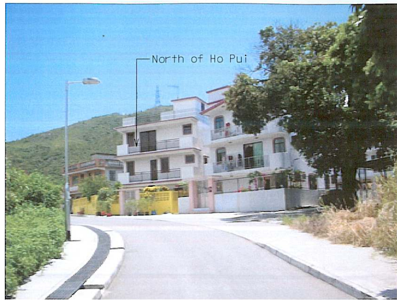
Photo No. B10 - LCA5 Village Landscape Character Area