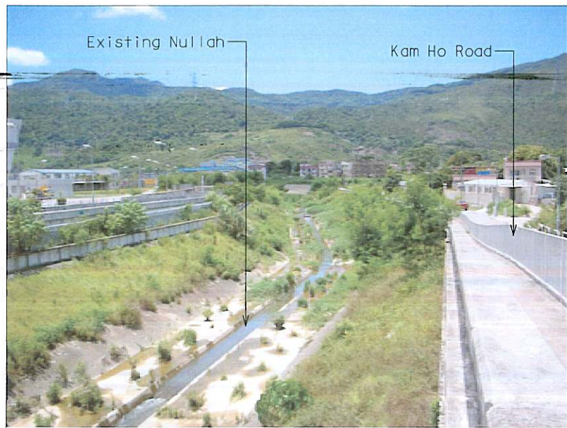
Photo No. B13 - LCA7 Nullah Landscape Character Area