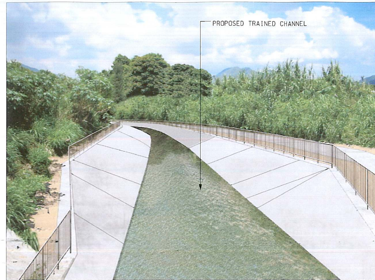
View without Mitigation Measures on Day One